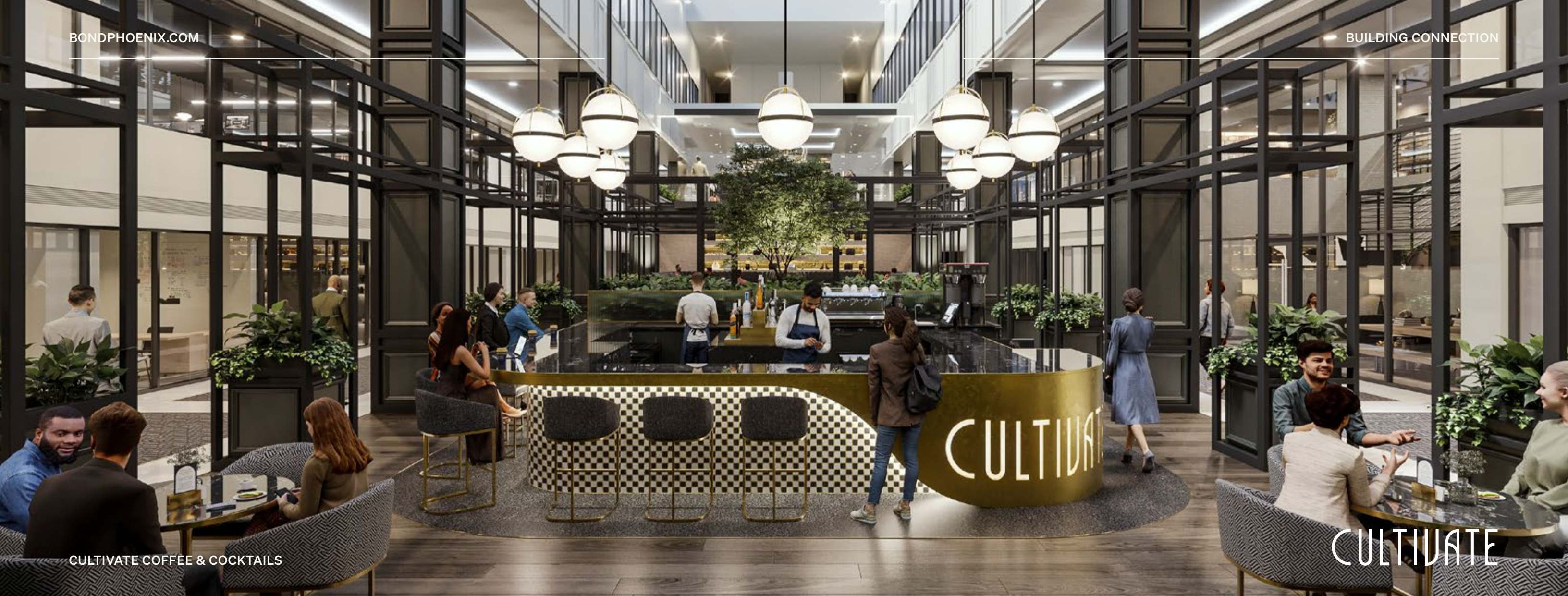
CULTIVATE COFFEE & COCKTAILS