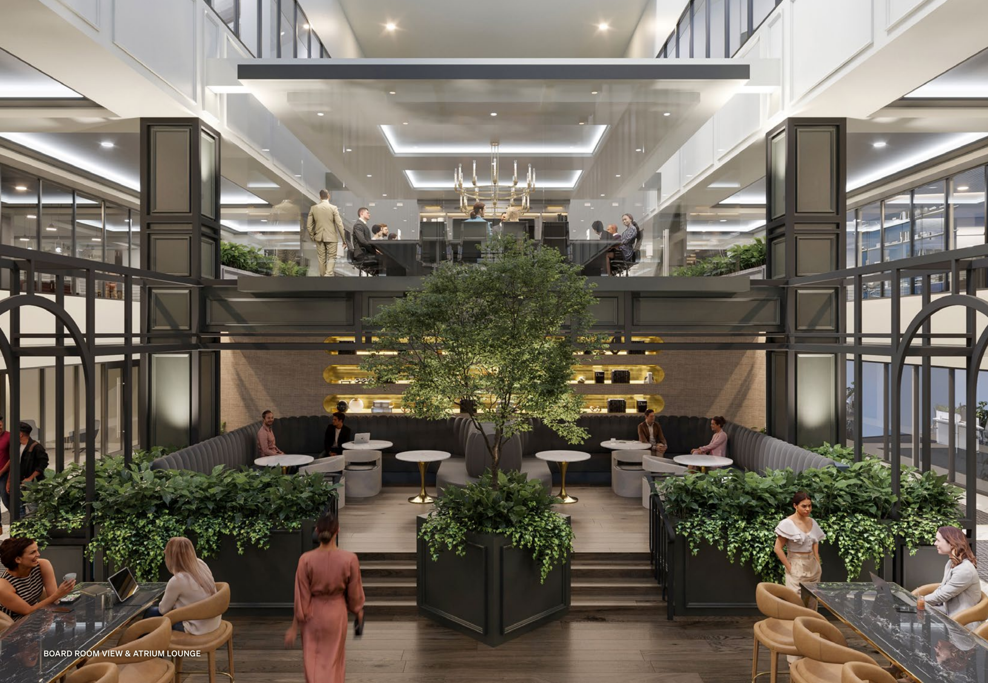
BOARD ROOM VIEW & ATRIUM LOUNGE