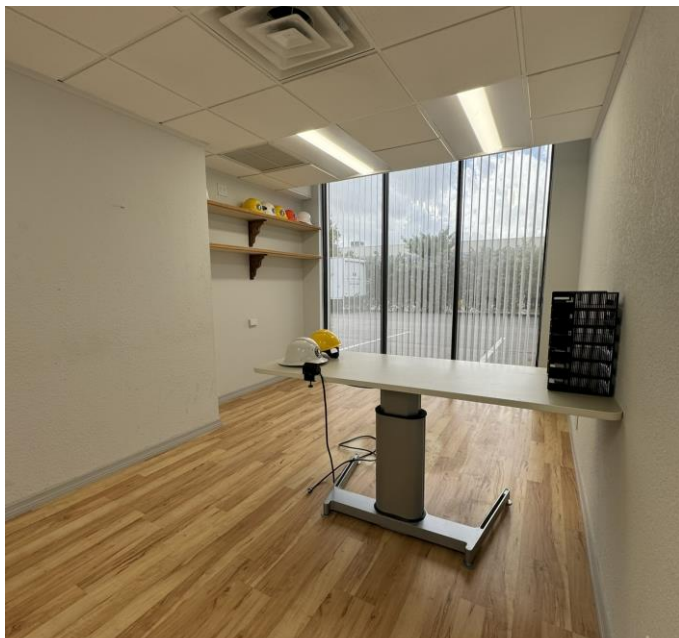
1,500 SF OFFICE SPACE

±750-2,250 SF Office/Warehouse Space Now Available