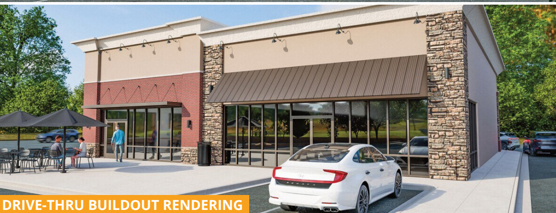
DRIVE-THRU BUILDOUT RENDERING