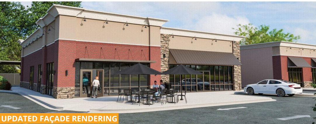
UPDATED FAÇADE RENDERING