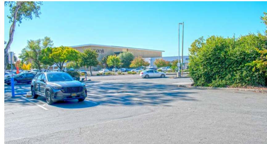
ACCESS FROM CLEVELAND AVE.