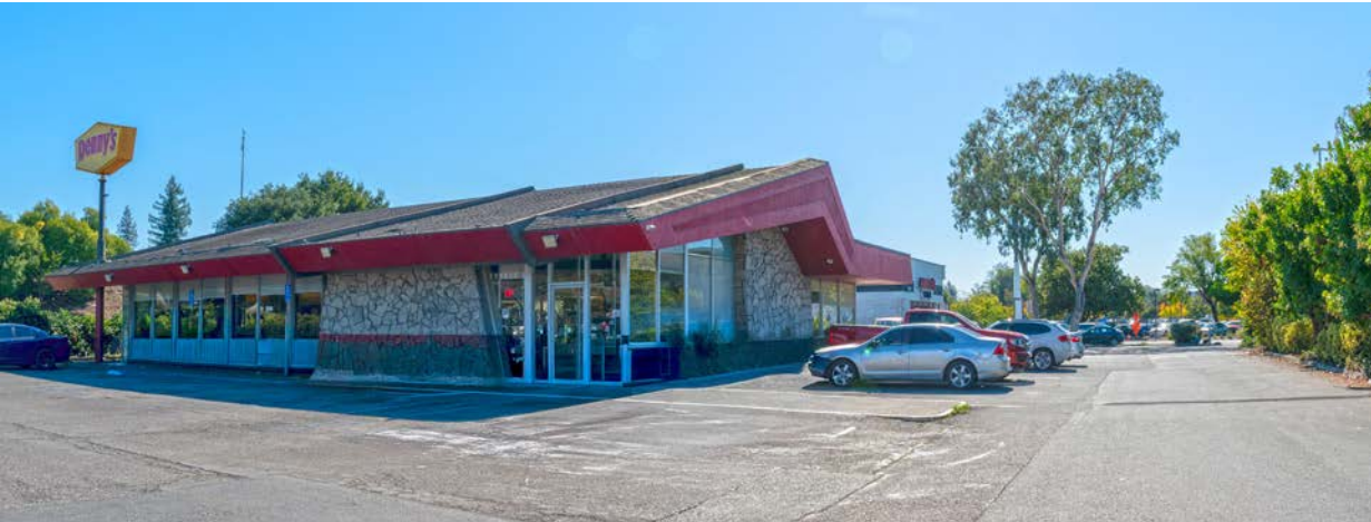
ACCESS FROM STEELE LANE