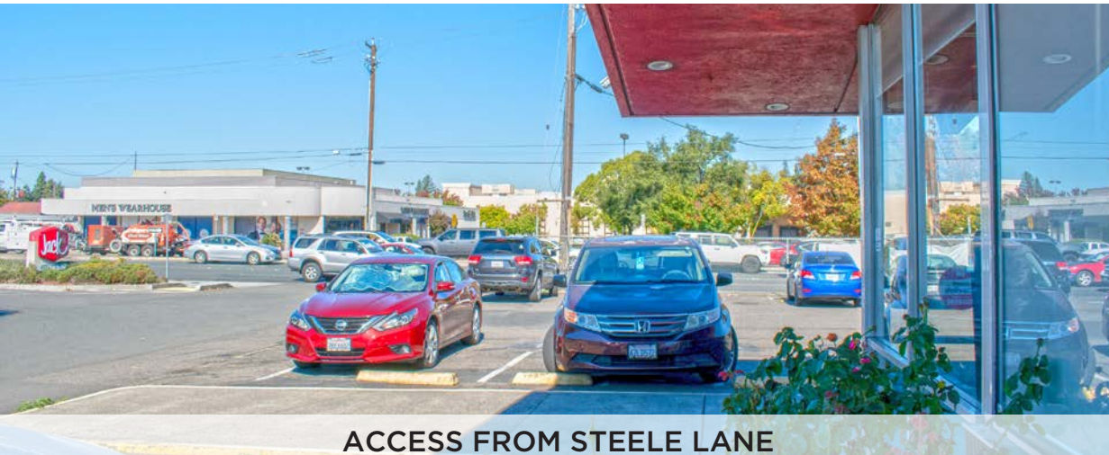
ACCESS FROM STEELE LANE