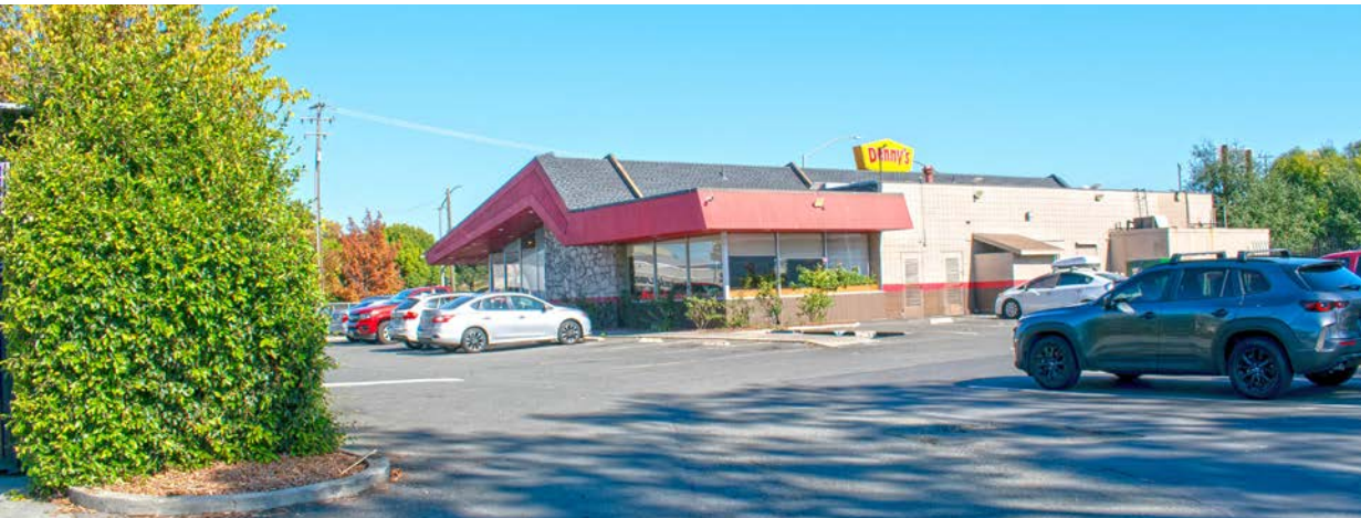
ACCESS FROM CLEVELAND AVE.