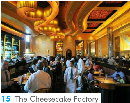
15 The Cheesecake Factory