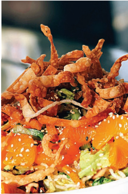
2 The Stand