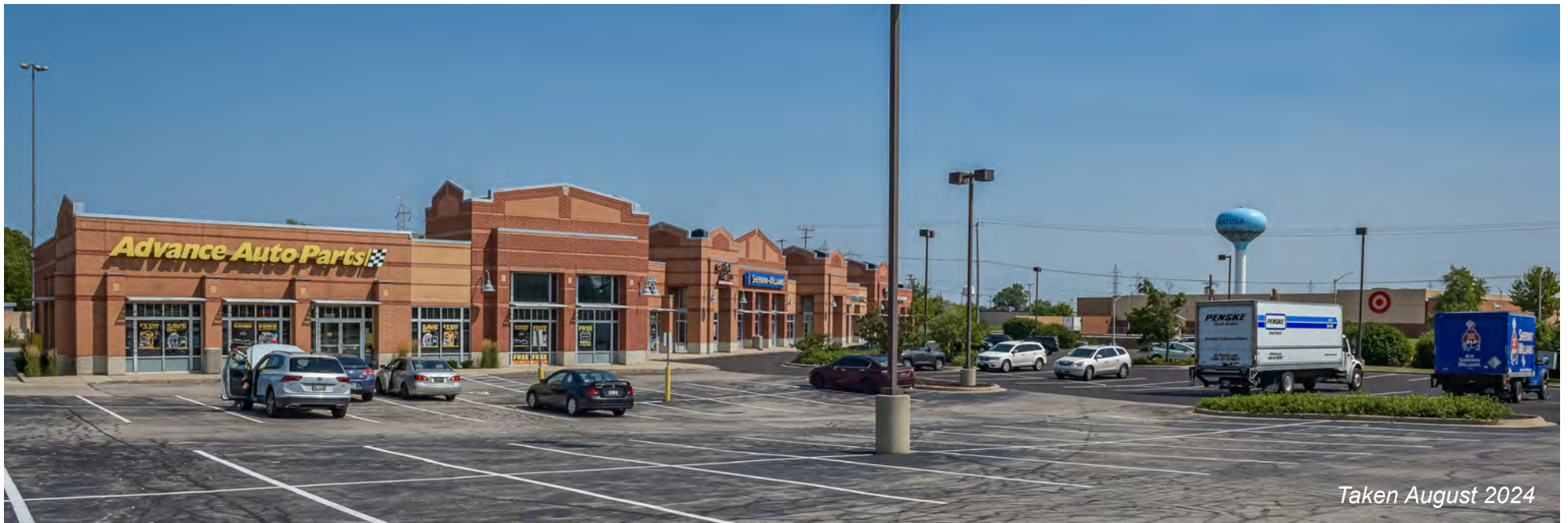
Taken August 2024