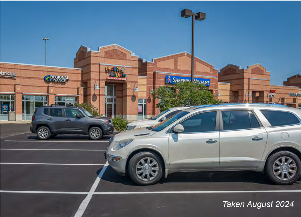
Taken August 2024