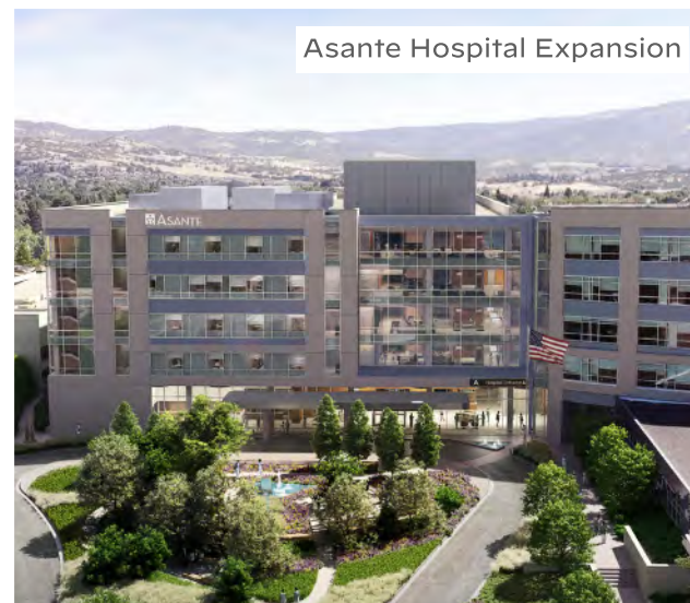
Asante Hospital Expansion