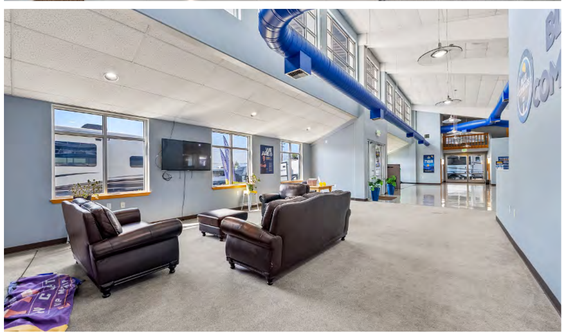
Interior Photos - Showroom