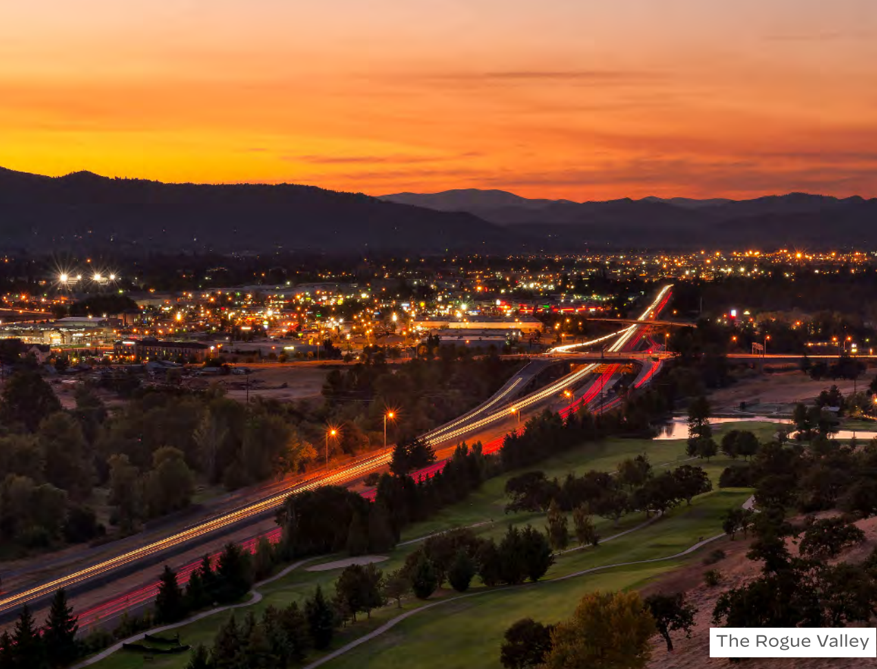
The Rogue Valley