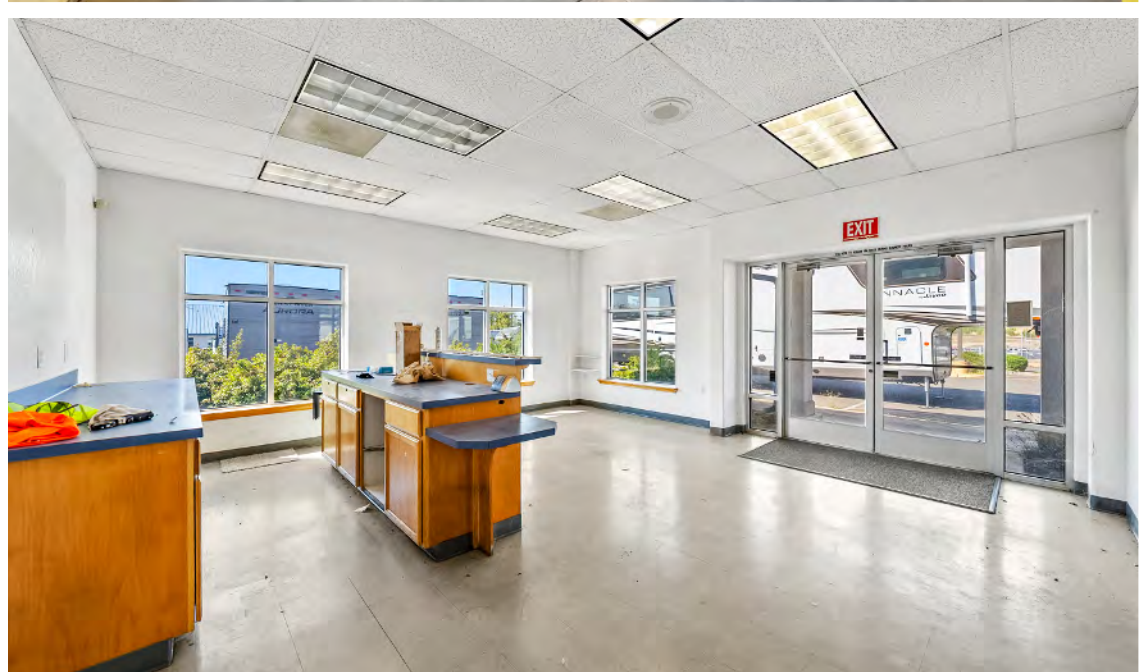
Interior Photos - Shop