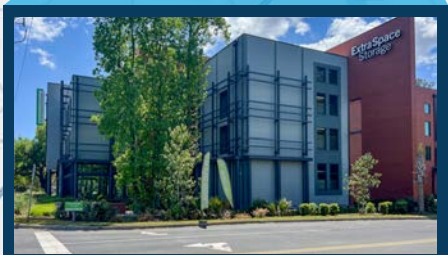
1861 ASHLEY RIVER RD CHARLESTON, SC 29407