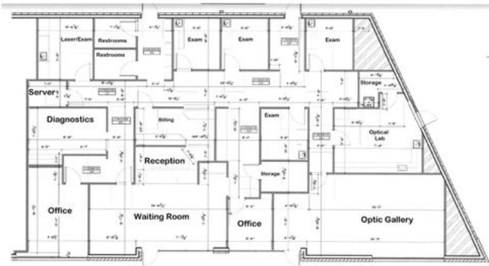
112-114 West Concho Ave. Approximately 3,250 square feet