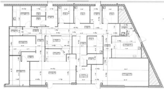
112-114 West Concho Ave. Approximately 3,250 square feet