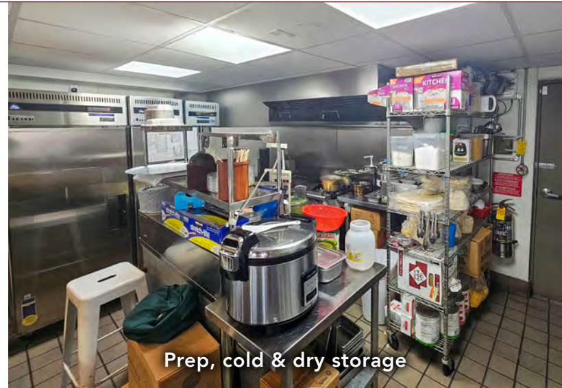
Prep, cold & dry storage