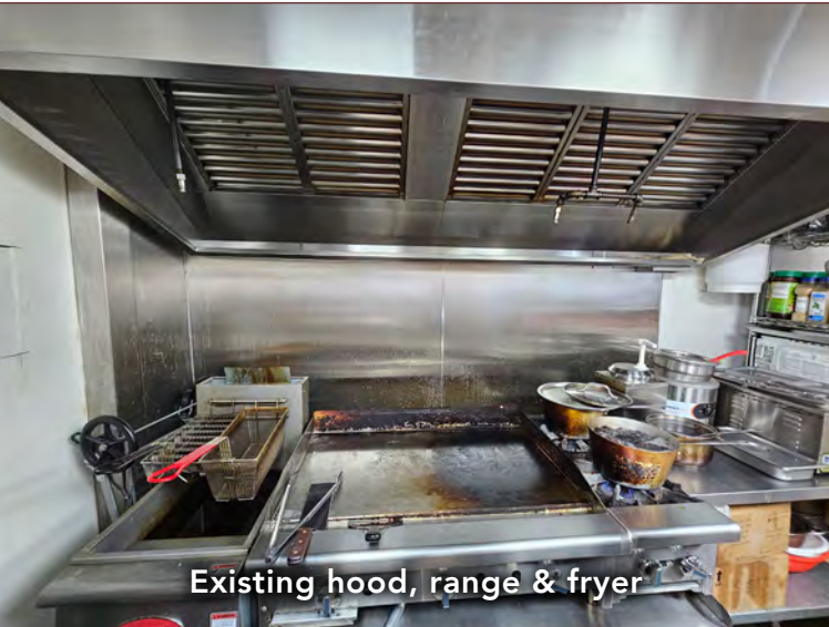
Existing hood, range & fryer