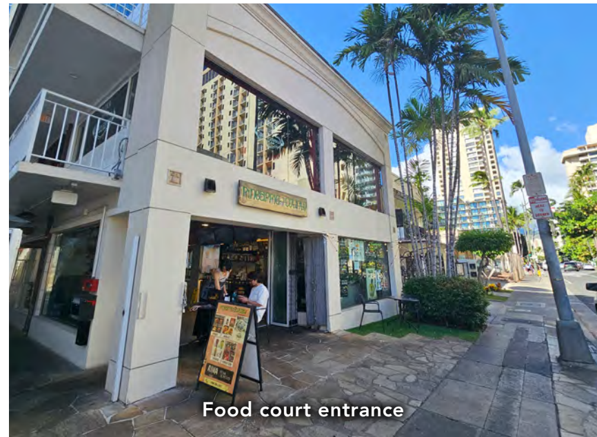
Food court entrance