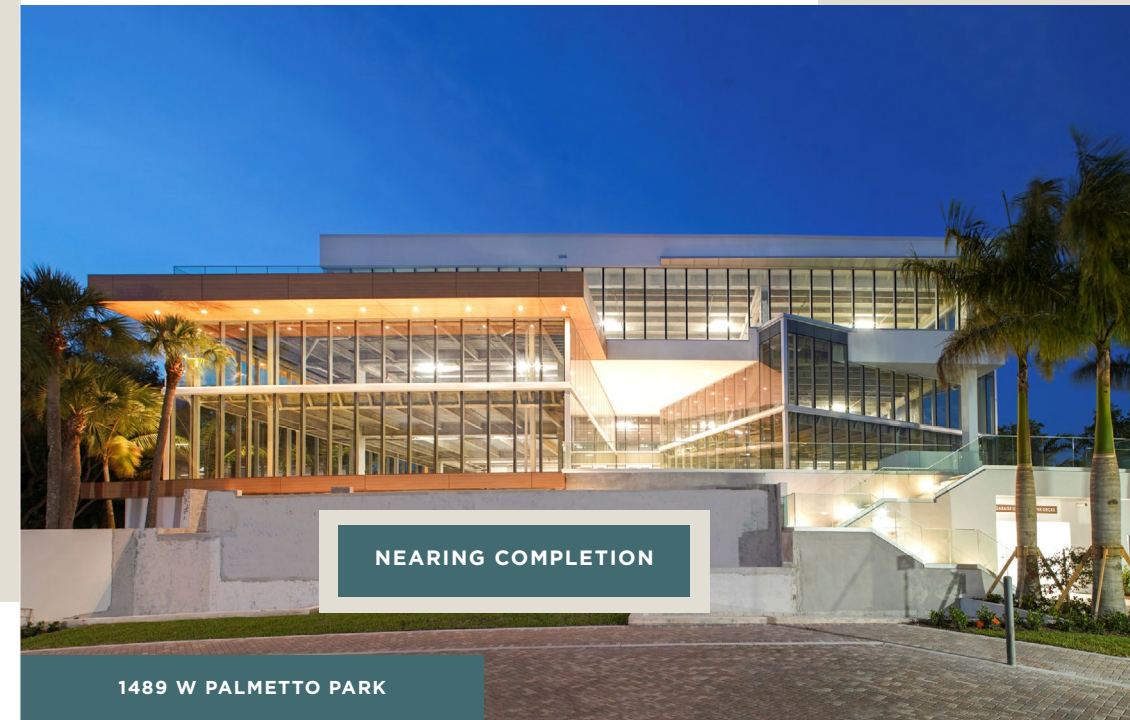
1489 W PALMETTO PARK