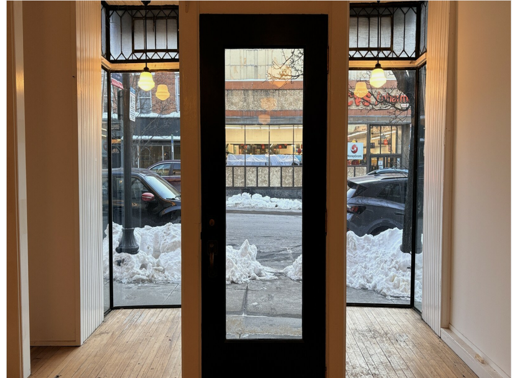
Front Entry and Windows looking toward Warren St