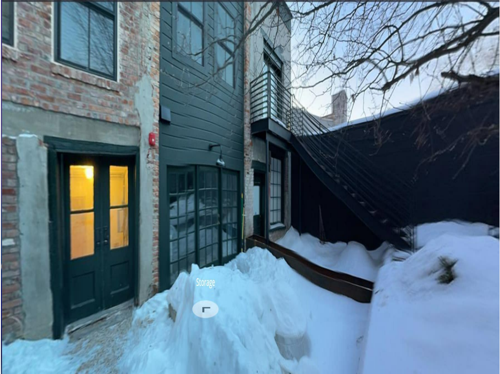
Rear Courtyard (usable by tenant)