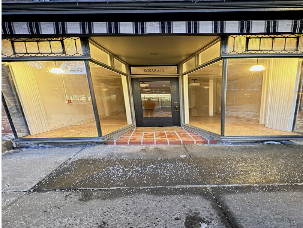
Showroom Entrance and Windows