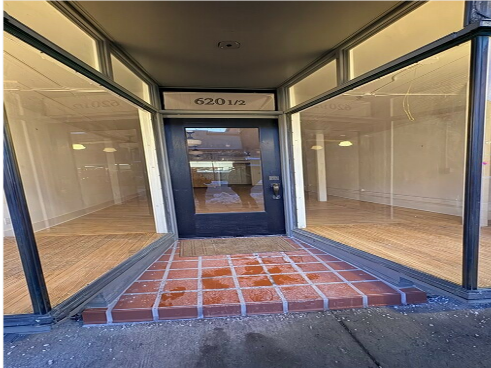
Showroom Entrance and Windows