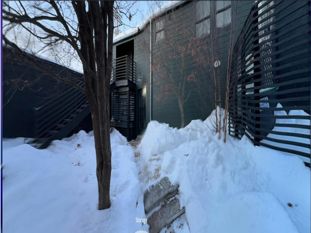
Rear Courtyard (usable by tenant)