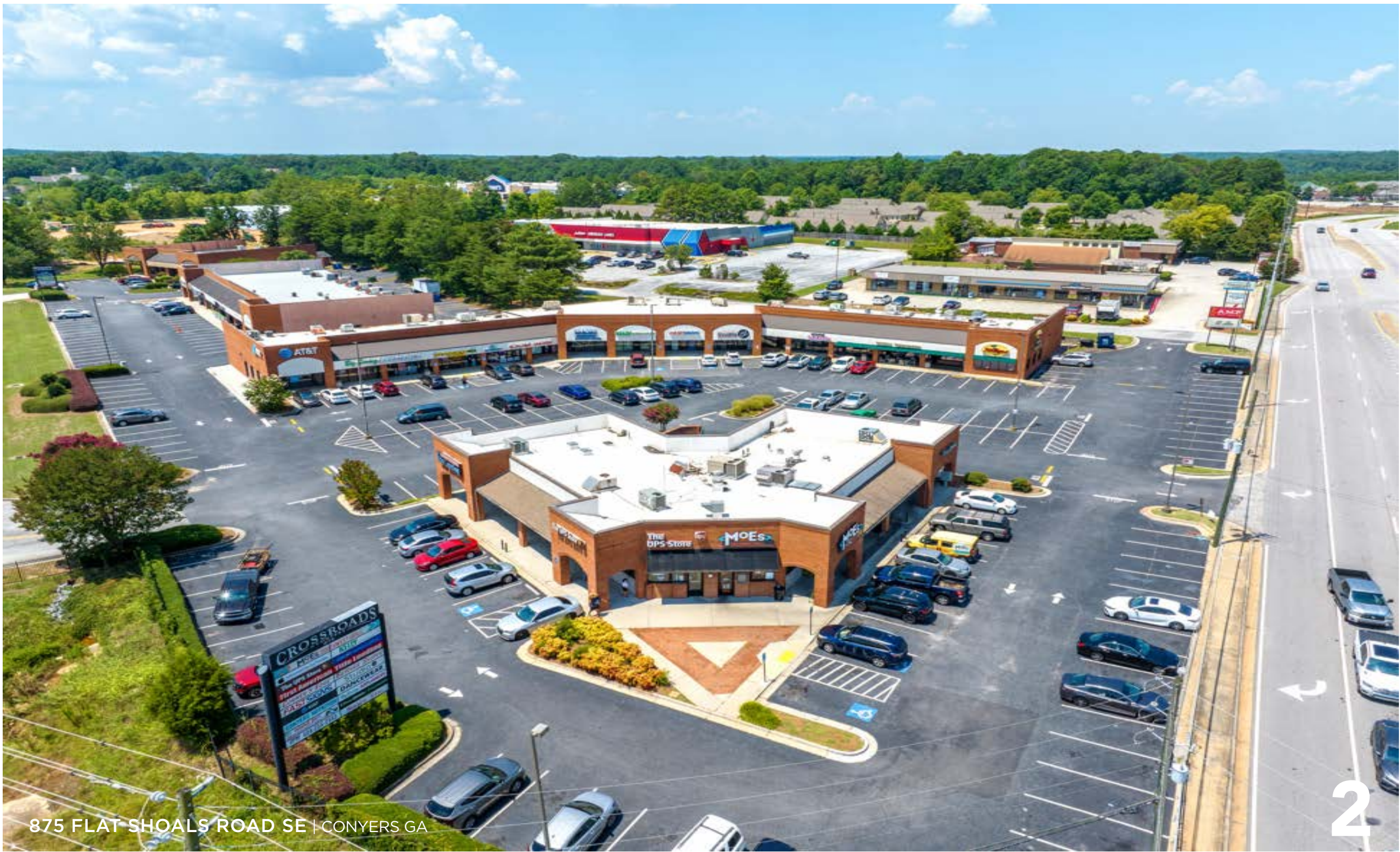
875 FLAT SHOALS ROAD SE | CONYERS GA