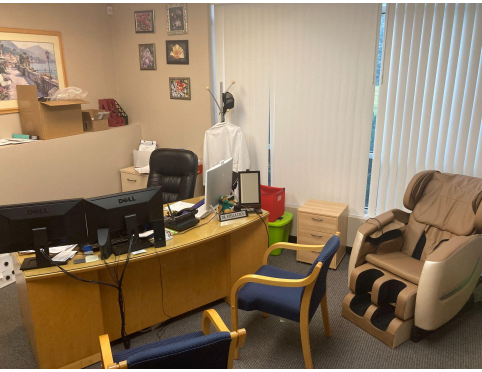
1 of 2 Private Offices