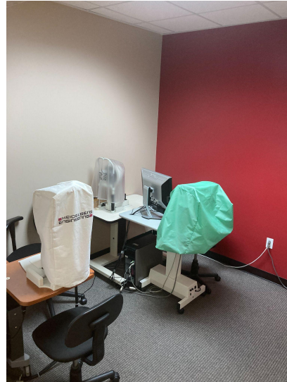
1 of 8 Exam Rooms