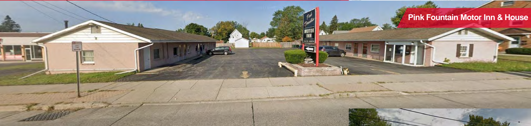
Pink Fountain Motor Inn & House