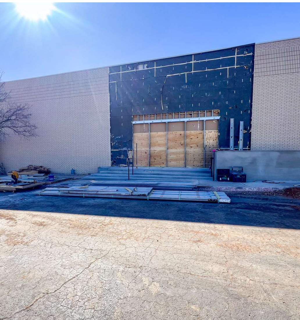
New Entrance to Suite is Under Construction | East of TJ Maxx