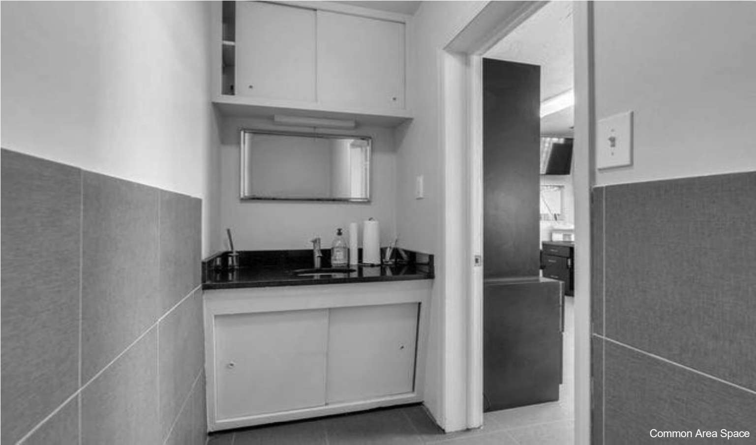
Common Area Space