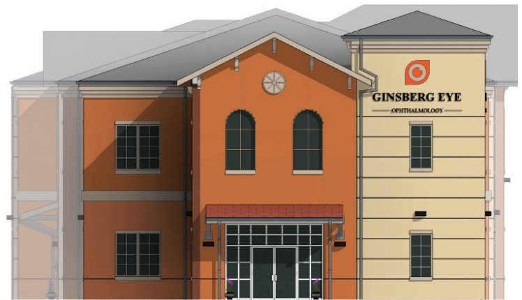
Building representation only, subject to change