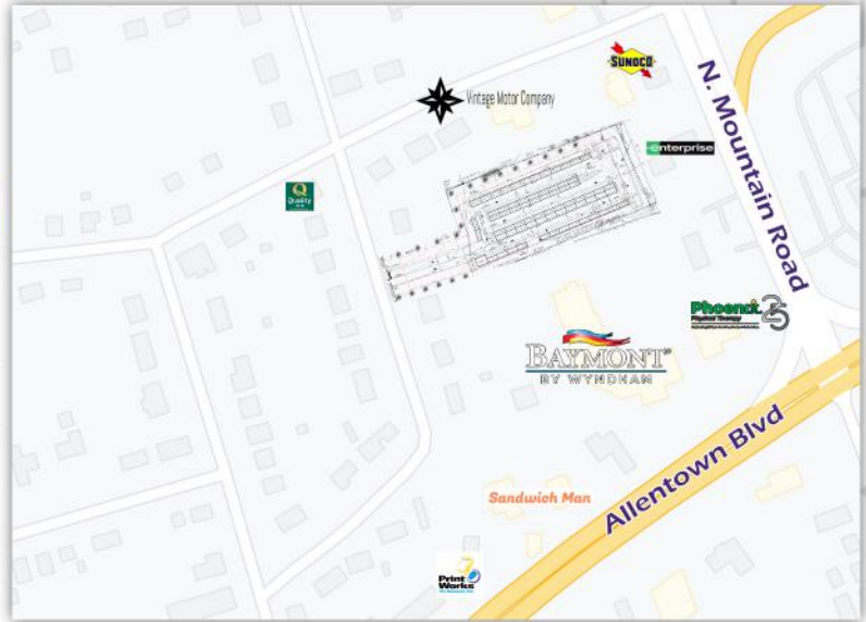
CONCEPTUAL SITE PLAN LAYOUT