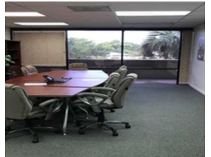
Suite 200 - Interior