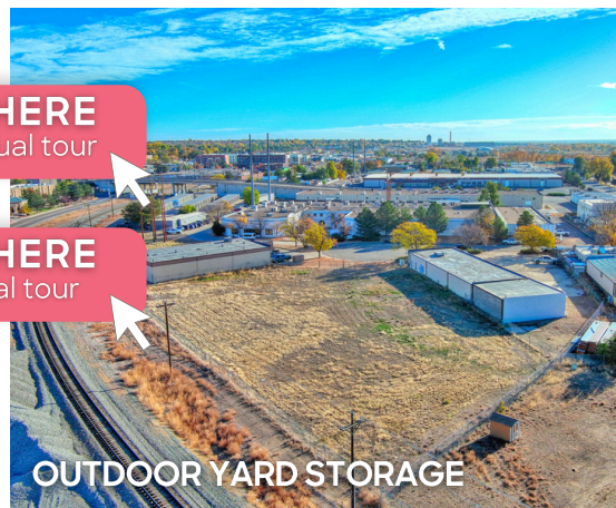
OUTDOOR YARD STORAGE