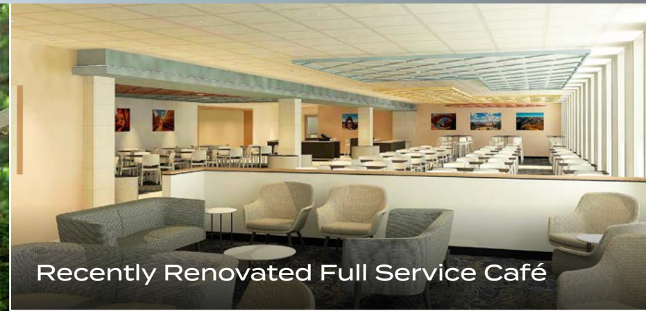
Recently Renovated Full Service Café