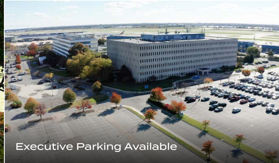
Executive Parking Available