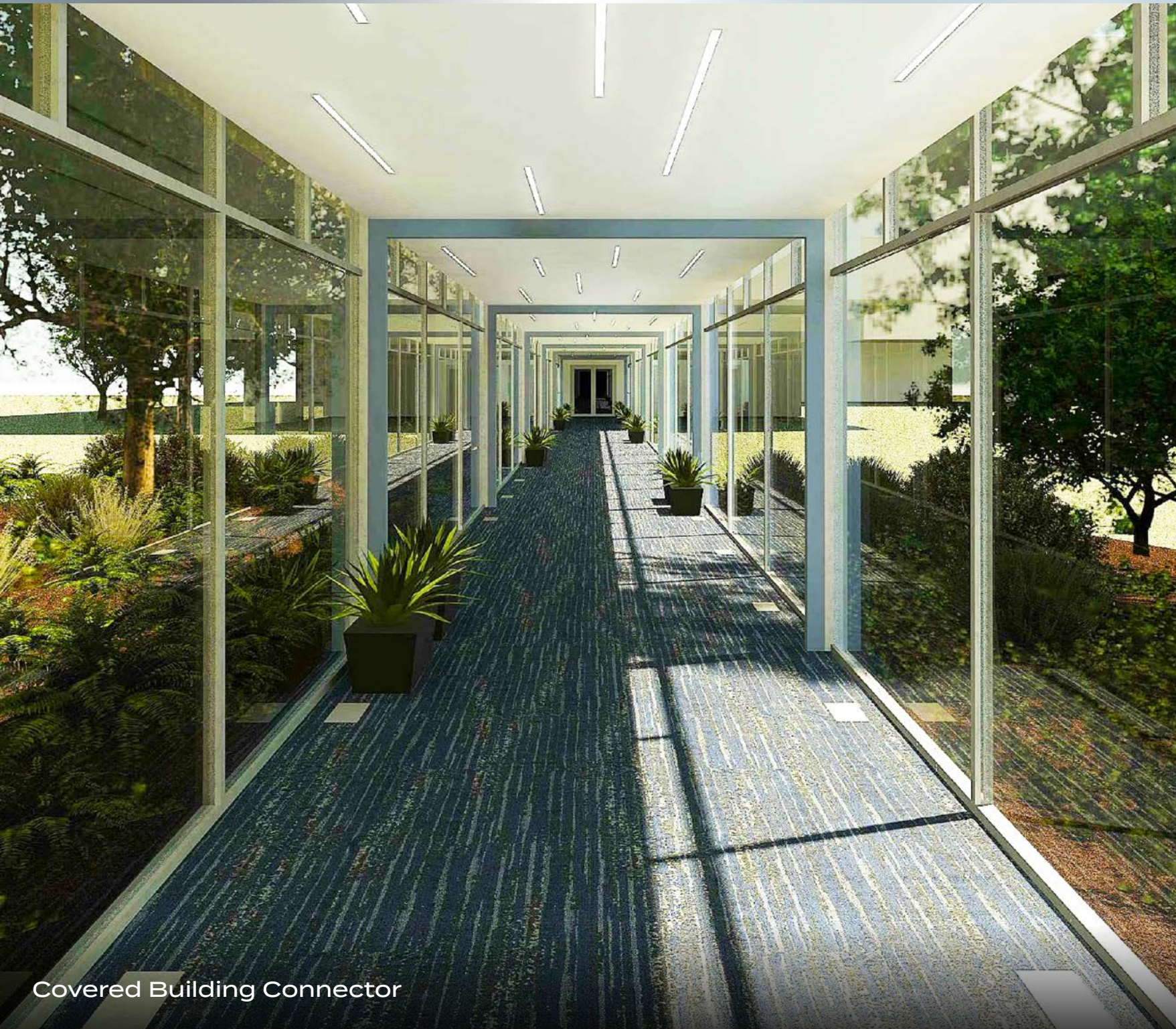
Covered Building Connector