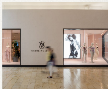
VICTORIA'S SECRET #3