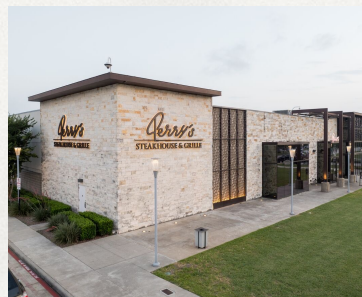
PERRY'S STEAKHOUSE & GRILLE #3