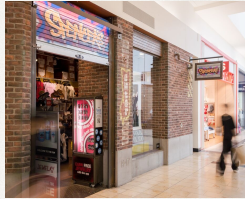
SPENCER GIFTS #1