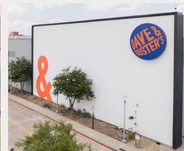
DAVE & BUSTERS #3