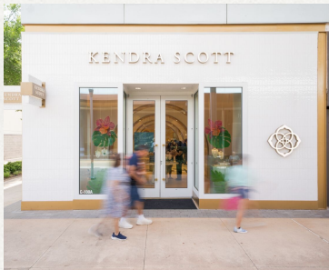
KENDRA SCOTT #2