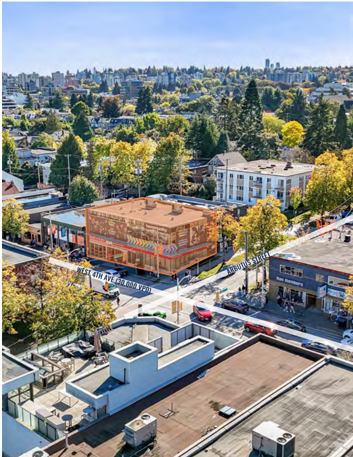
WEST 4TH X ARBUTUS ST

Marcus & Millichap is pleased to present the opportunity to acquire 2020 Arbutus Street, Vancouver, B.C. (the “Subject Property”). The Subject Property is anchored by the Canadian Imperial Bank of Commerce (“CIBC”), complemented by North American Kommunity Fitness Inc. and Global Shoe Connection Inc., with all tenants operating under triple-net leases that provide stable cash flow with minimal landlord responsibility. Situated at the corner of West 4th Avenue and Arbutus Street in Kitsilano, the site benefits from exceptional exposure and on-site parking at the epicenter of one of Vancouver's strongest retail corridors.