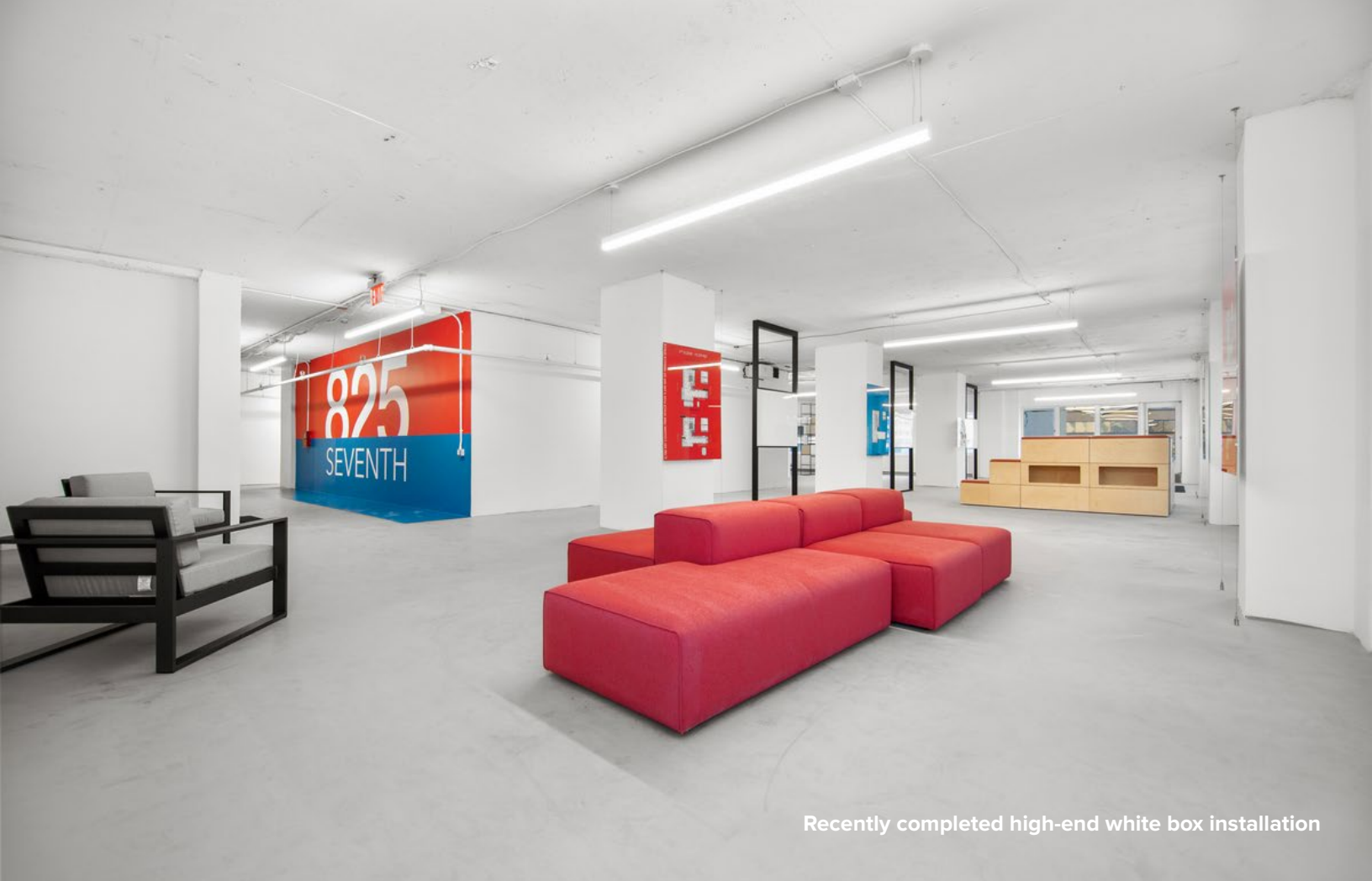
Recently completed high-end white box installation