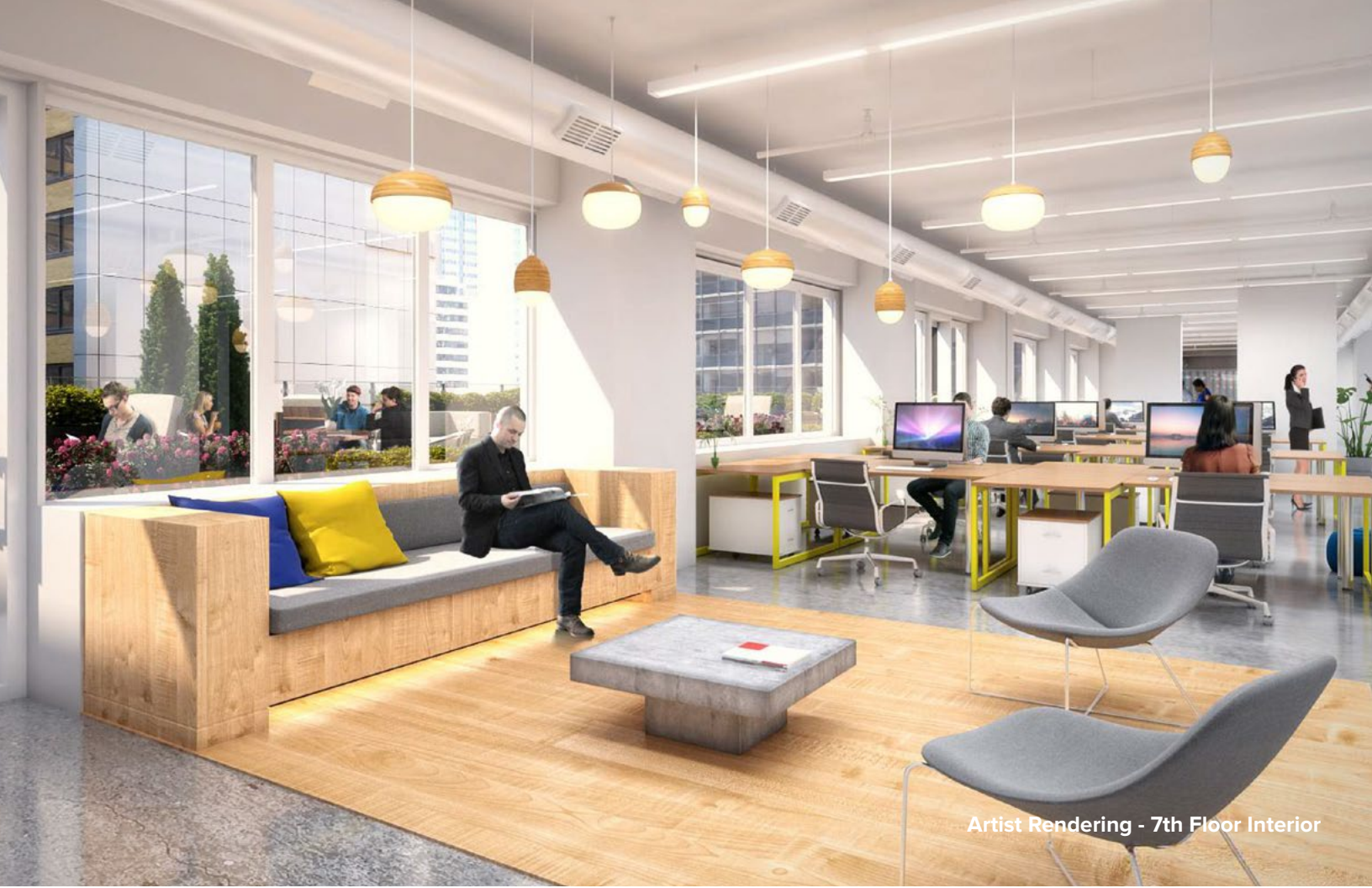
Artist Rendering - 7th Floor Interior