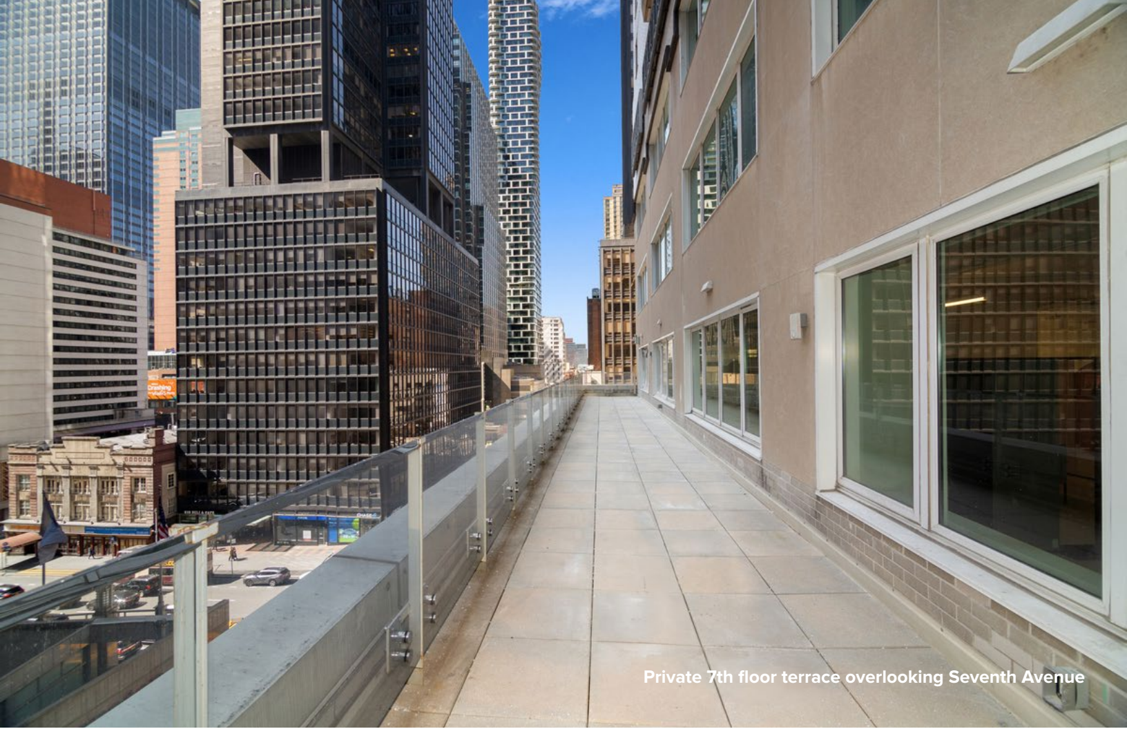
Private 7th floor terrace overlooking Seventh Avenue