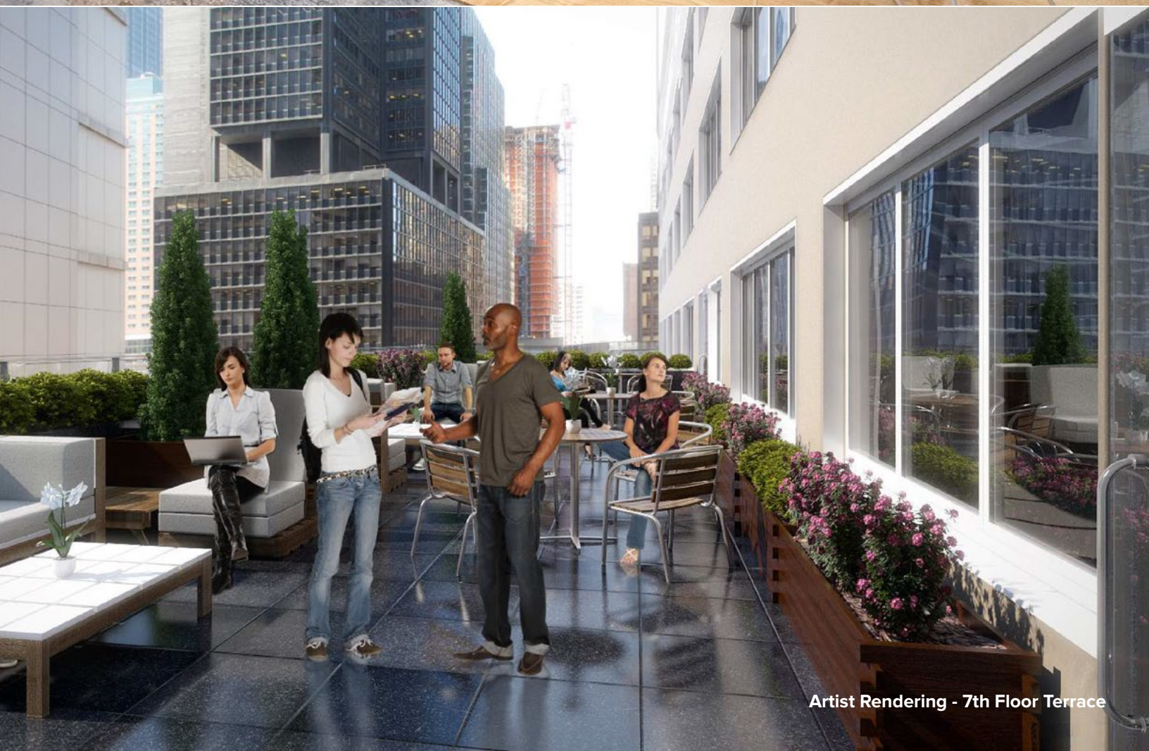
Artist Rendering - 7th Floor Terrace