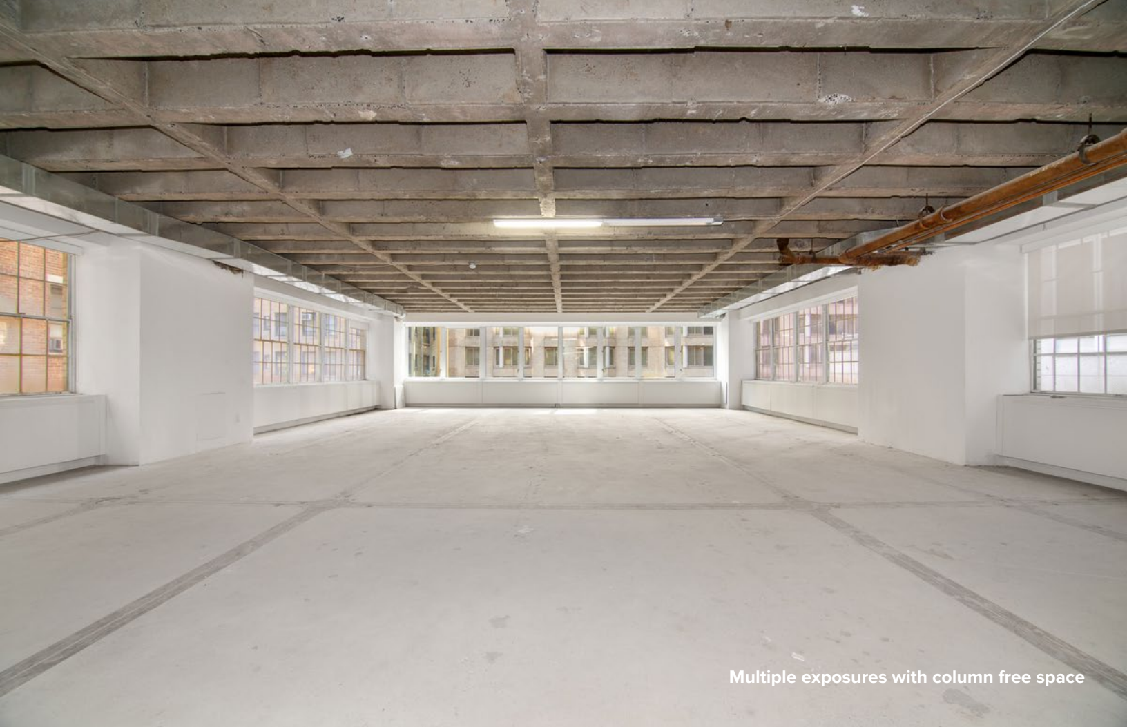
Multiple exposures with column free space