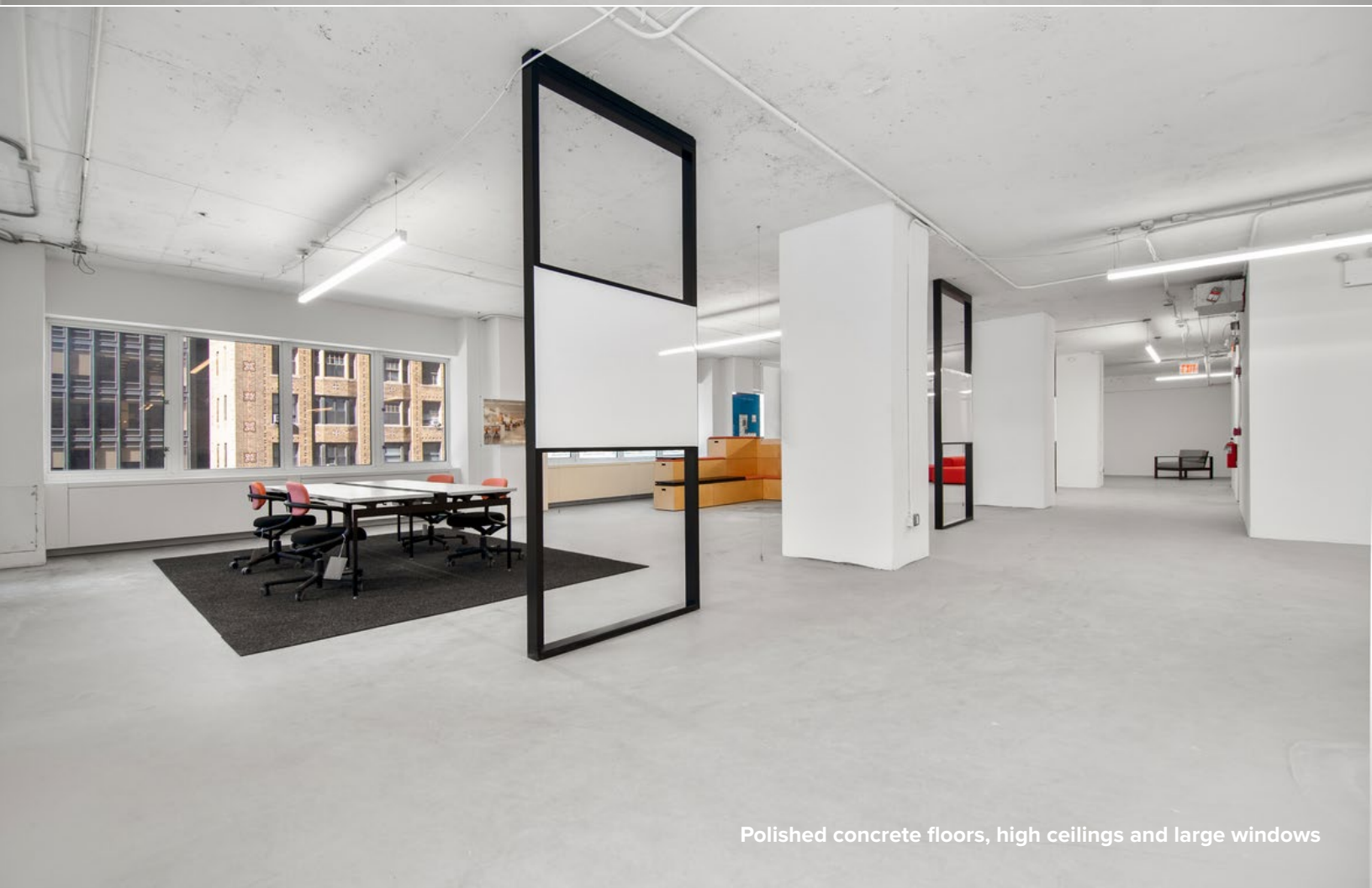
Polished concrete floors, high ceilings and large windows