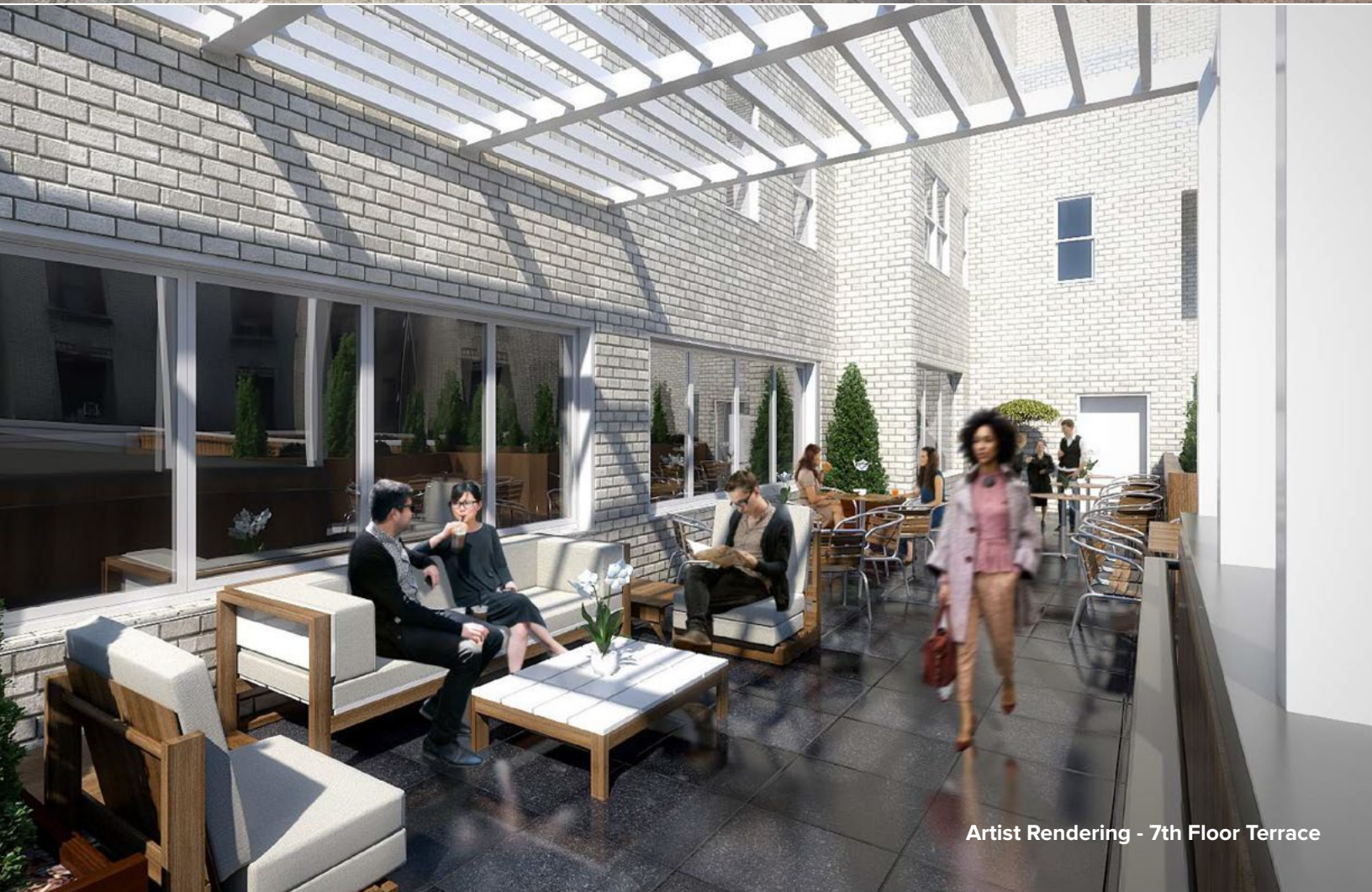
Artist Rendering - 7th Floor Terrace