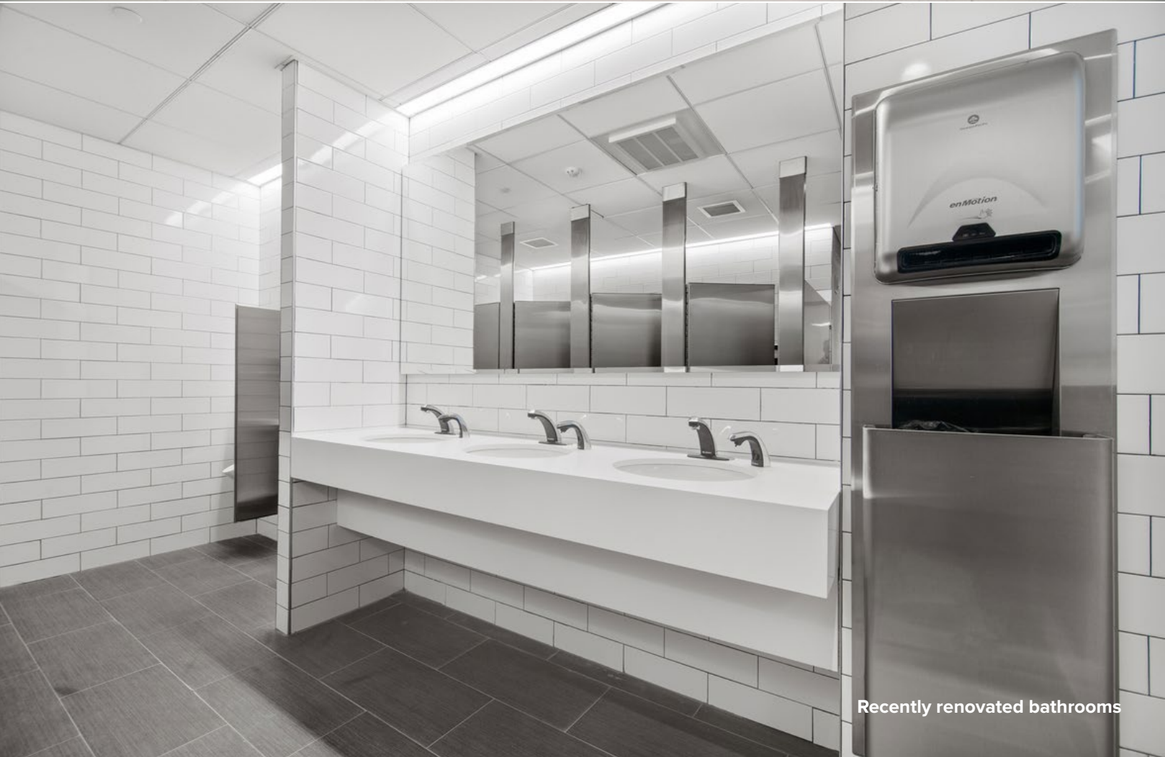
Recently renovated bathrooms