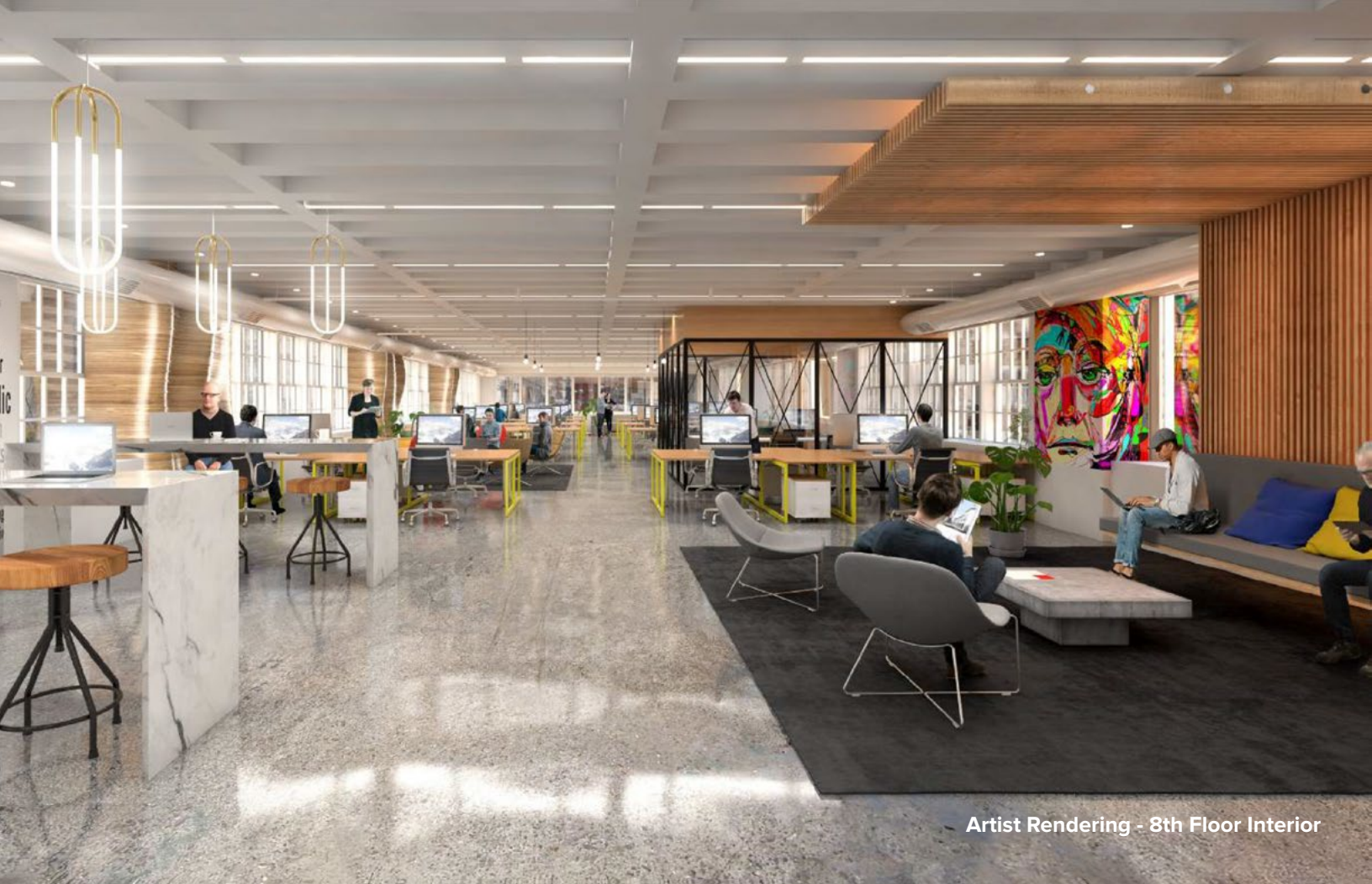
Artist Rendering - 8th Floor Interior