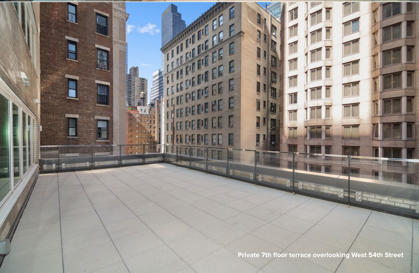
Private 7th floor terrace overlooking West 54th Street