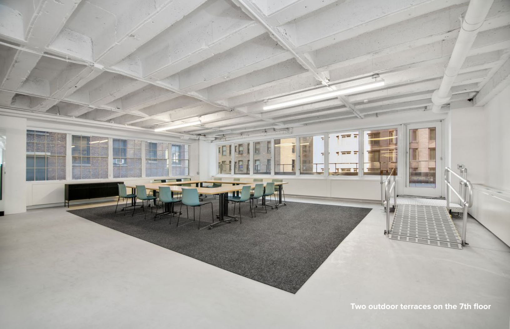
Two outdoor terraces on the 7th floor