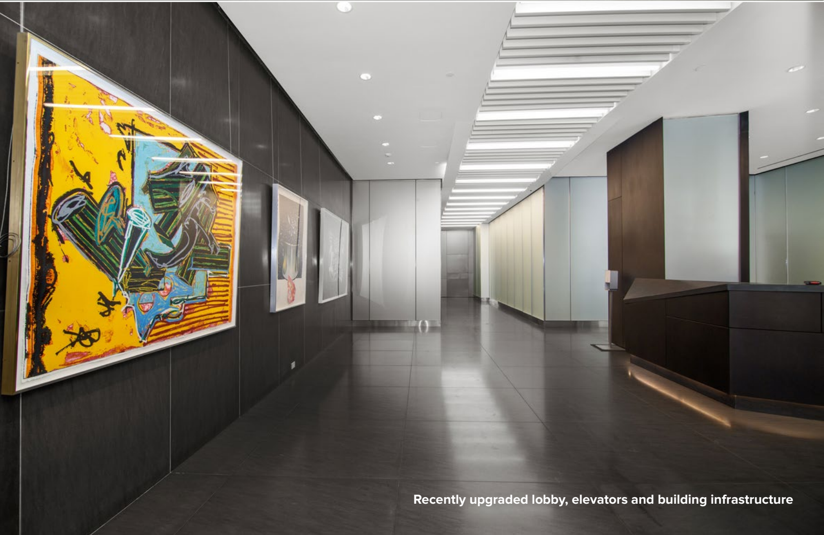
Recently upgraded lobby, elevators and building infrastructure