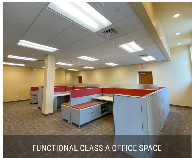
FUNCTIONAL CLASS A OFFICE SPACE