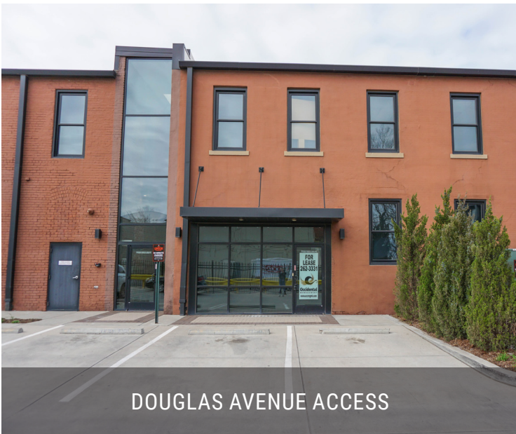
DOUGLAS AVENUE ACCESS