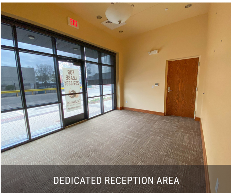
DEDICATED RECEPTION AREA