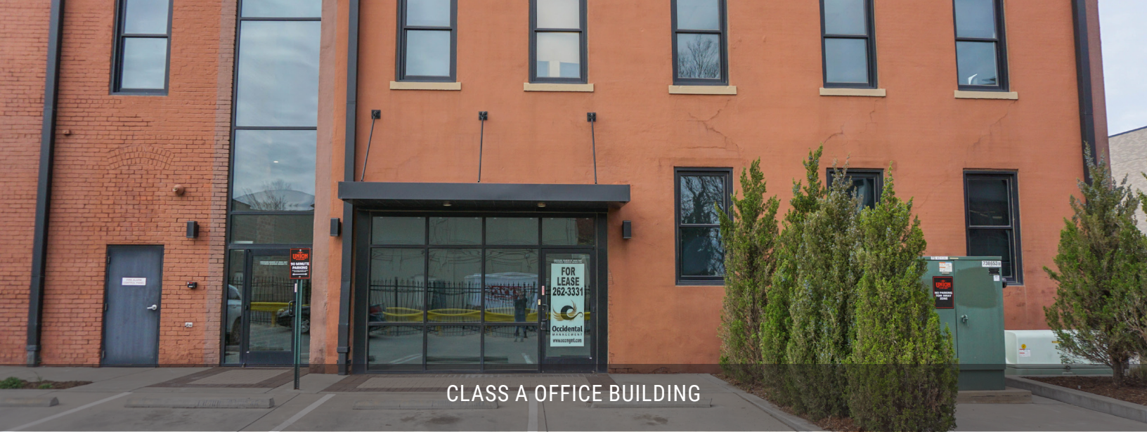
CLASS A OFFICE BUILDING