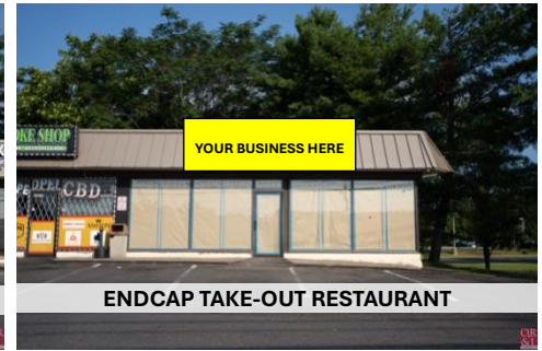
ENDCAP TAKE-OUT RESTAURANT