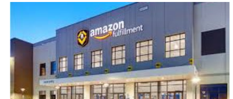
Amazon Fulfillment Center Land Assemblage