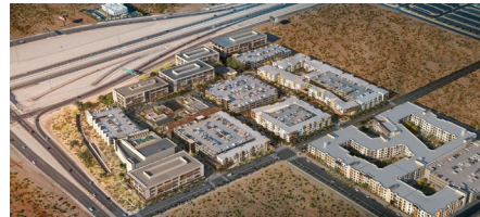
UnCommons Land Assemblage Sale