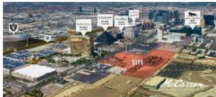
Las Vegas Boulevard Bankruptcy Sale