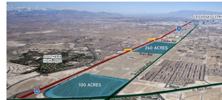
Las Vegas Blvd South Land Sale