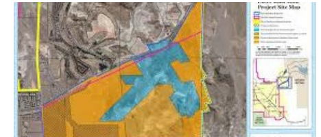
Lakemoor / 3 Kids Mine Master Plan Land Sale / Remediation