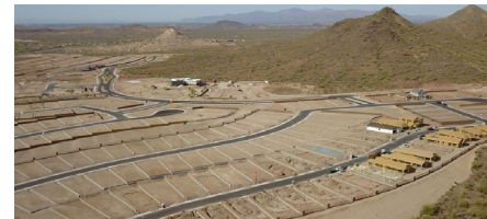
Kimball Hill Homes Bankruptcy Sale