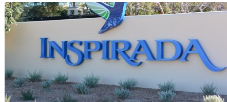
Inspirada Town Center Bankruptcy Sale