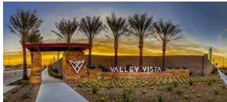
Valley Vista / Park Highlands Master Plan Land Sale