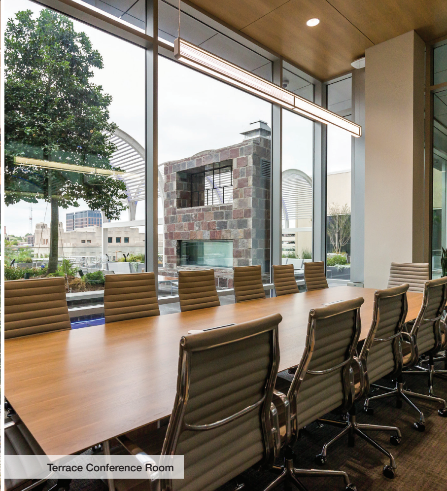
Terrace Conference Room