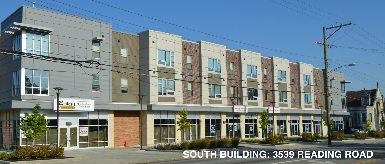
SOUTH BUILDING: 3539 READING ROAD