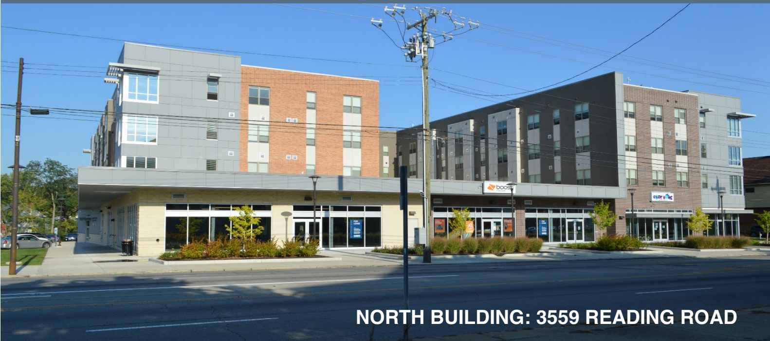
NORTH BUILDING: 3559 READING ROAD