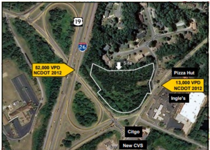
Hospitality Site · 4.4 Acres · Weaverville, NC