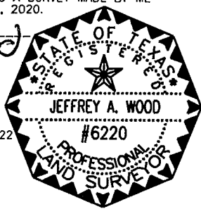
EXHIBIT "A" PARCEL P00027233 PAGE 3 OF 4

JEFFREY A. WOOD REGISTERED PROFESSIONAL LAND SURVEYOR NO. 6220 STATE OF TEXAS FIRM CERTIFICATE NO. 101011-00 DATE: JULY 5, 2022 REVISED: SEPTEMBER 21, 2022