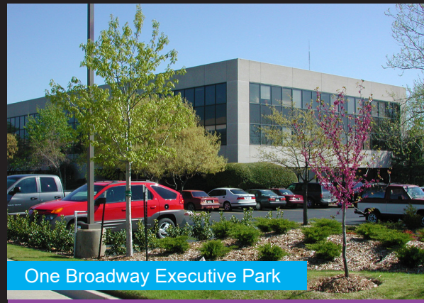
One Broadway Executive Park