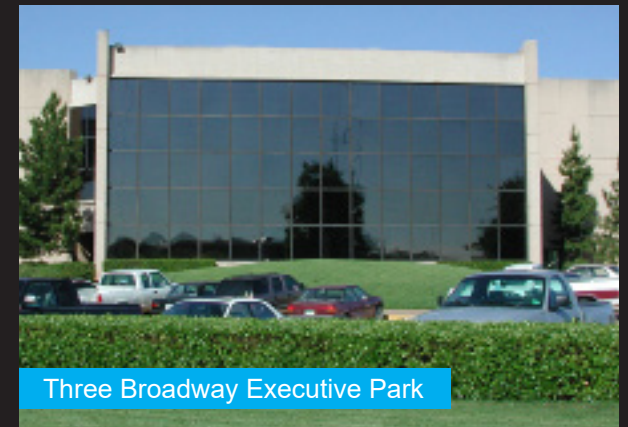
Three Broadway Executive Park