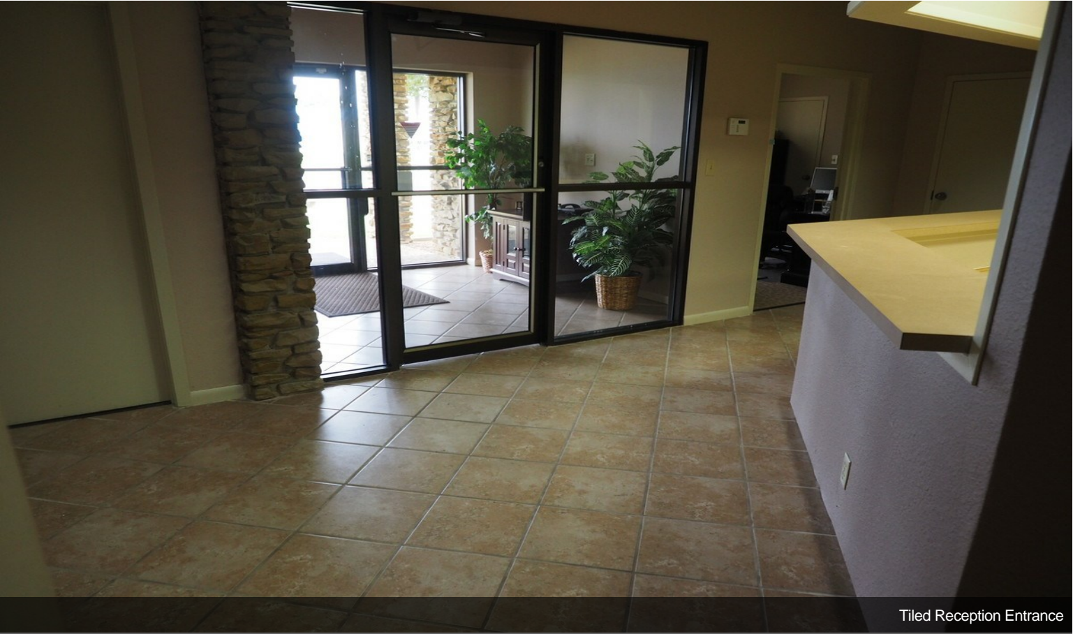
Tiled Reception Entrance