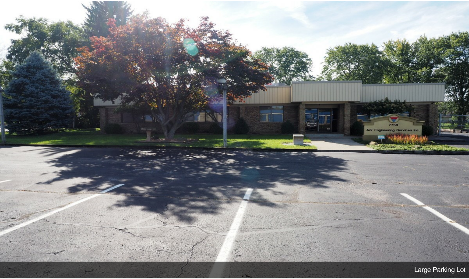
Large Parking Lot