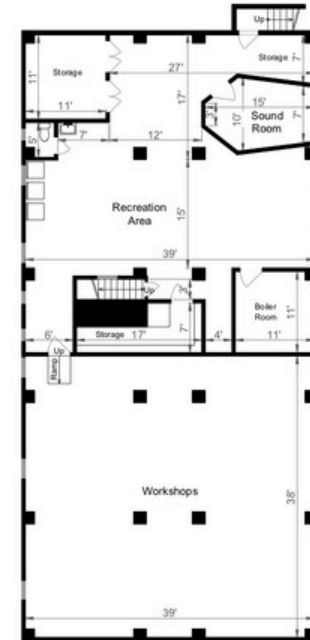
LOWER LEVEL 3,495 SQ FT

Rendering by Floor Plan Visuals. All measurements are approximate. While deemed reliable, no information on these floor plans should be relied upon without independent verification.