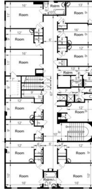
SECOND FLOOR 3,445 SQ FT

660 OAK STREET | SAN FRANCISCO, CA 94117