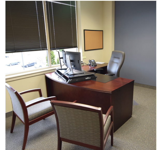
Suite 205 - 2nd Floor - 3,966± RSF