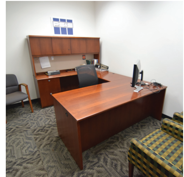
Suite 310 - 3rd Floor - 2,474± RSF