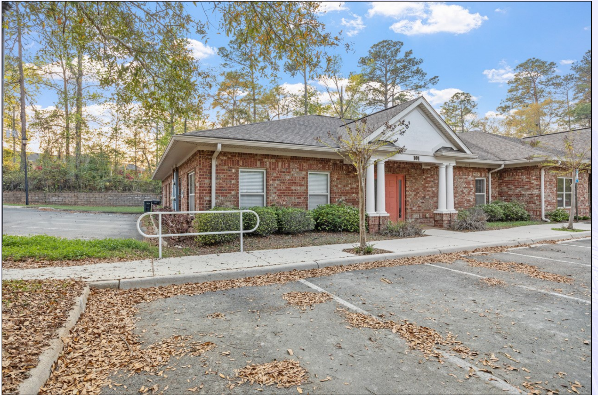
Exterior Side View