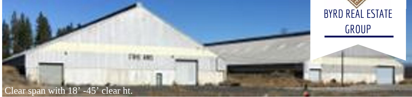
Clear span with 18' -45' clear ht.