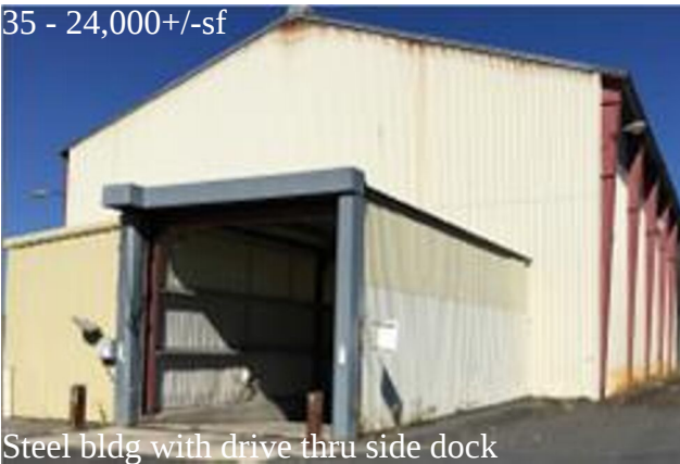
Steel bldg with drive thru side dock