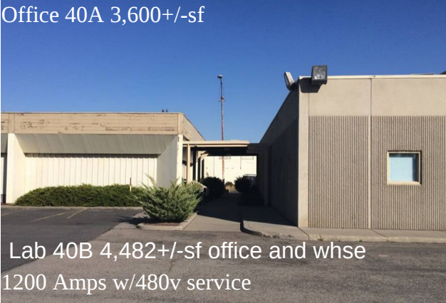
Lab 40B 4,482+/-sf office and whse 1200 Amps w/480v service