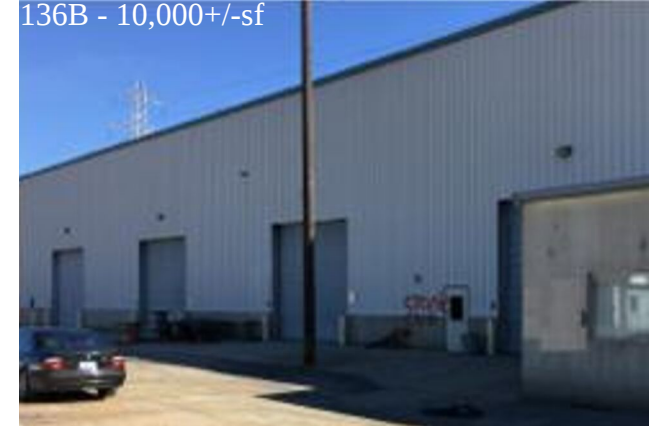
136B - 10,000+/-sf

All information is furnished by the Owner &/or Broker and believed to be complete and correct. The Owner &/or Broker, however, cannot be responsible for changes, errors, omissions or withdrawals of this offering. The above information is from sources deemed reliable but should be verified by parties that could be adversely affected by any statements or information. This is not an offering of sub-agency, with commission splits to be determined.