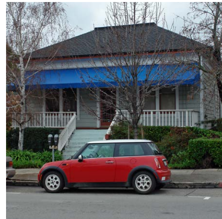
813 D Street, San Rafael