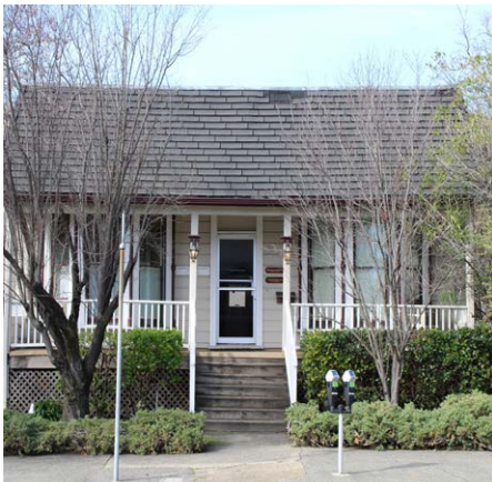
817 D Street, San Rafael