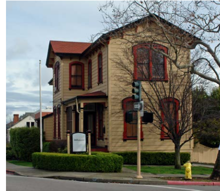
824 E Street, San Rafael