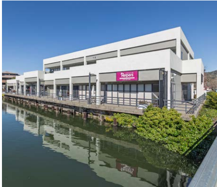
777 Grand Ave, San Rafael