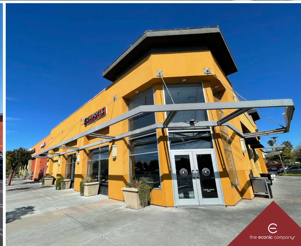
Charleston Plaza | Mountain View, CA