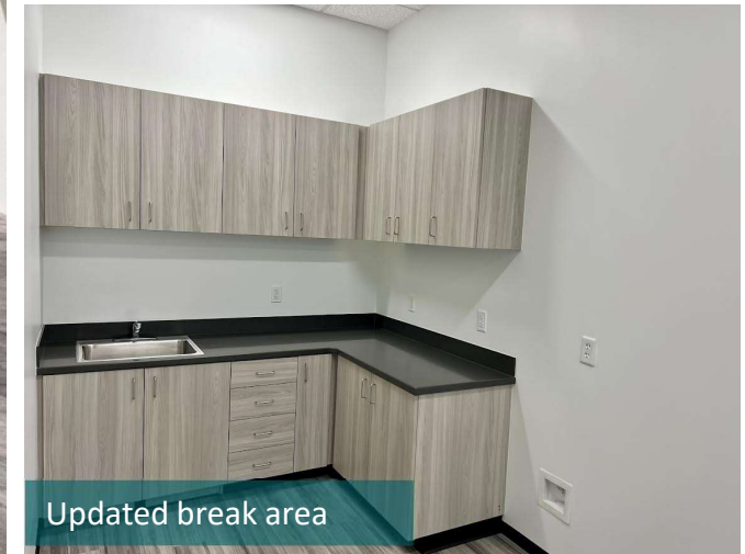
Updated break area