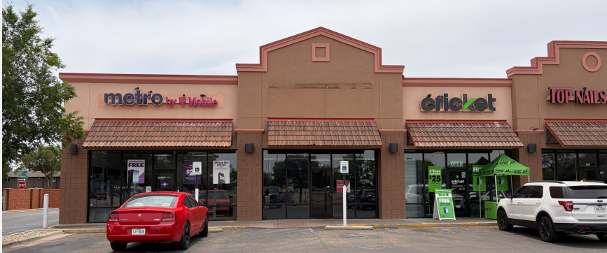
Suite 201: 1,455 SF