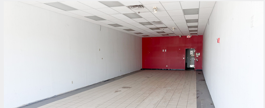
Suite 91001: 4,160 SF