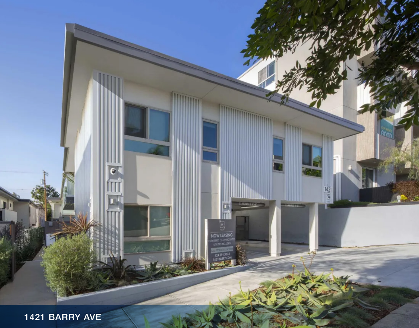
1421 BARRY AVE