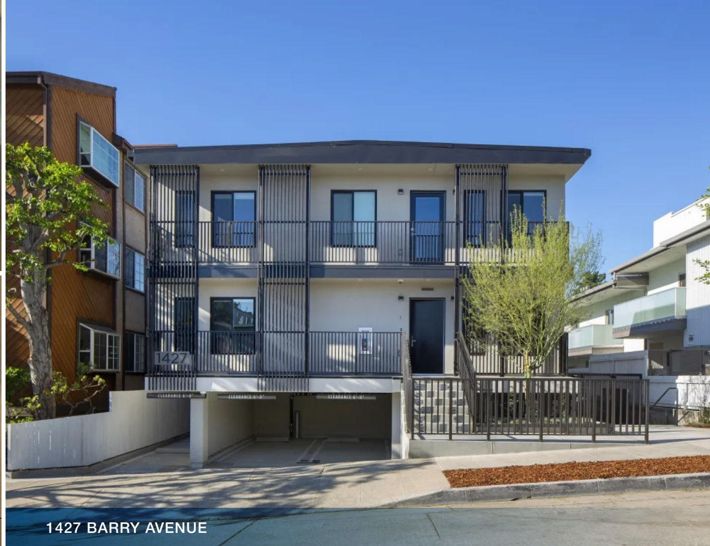
1427 BARRY AVENUE