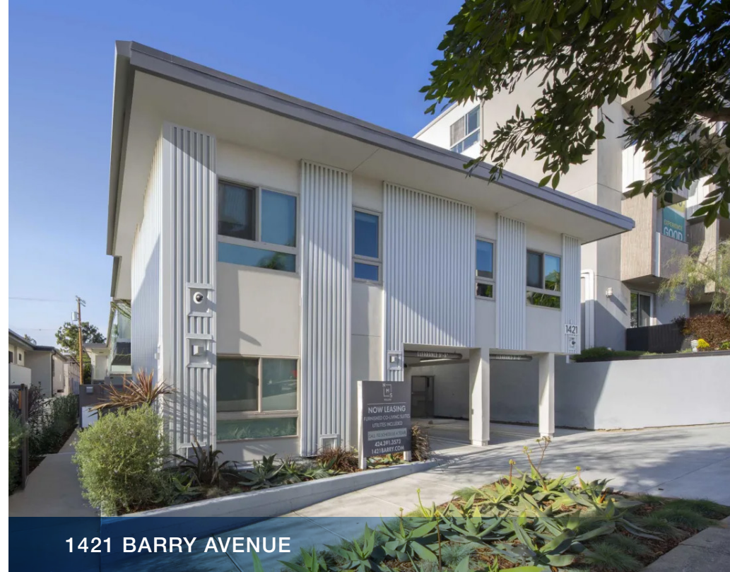
1421 BARRY AVENUE

Note: *Buyer to verify legal bedroom and bathroom count including recent conversions. Marcus & Millichap and Mission Capital have not made any investigation and makes no warranty or representation with respect to the presented bedroom and bathroom count. The information contained herein is not a substitute for a thorough due diligence investigation.