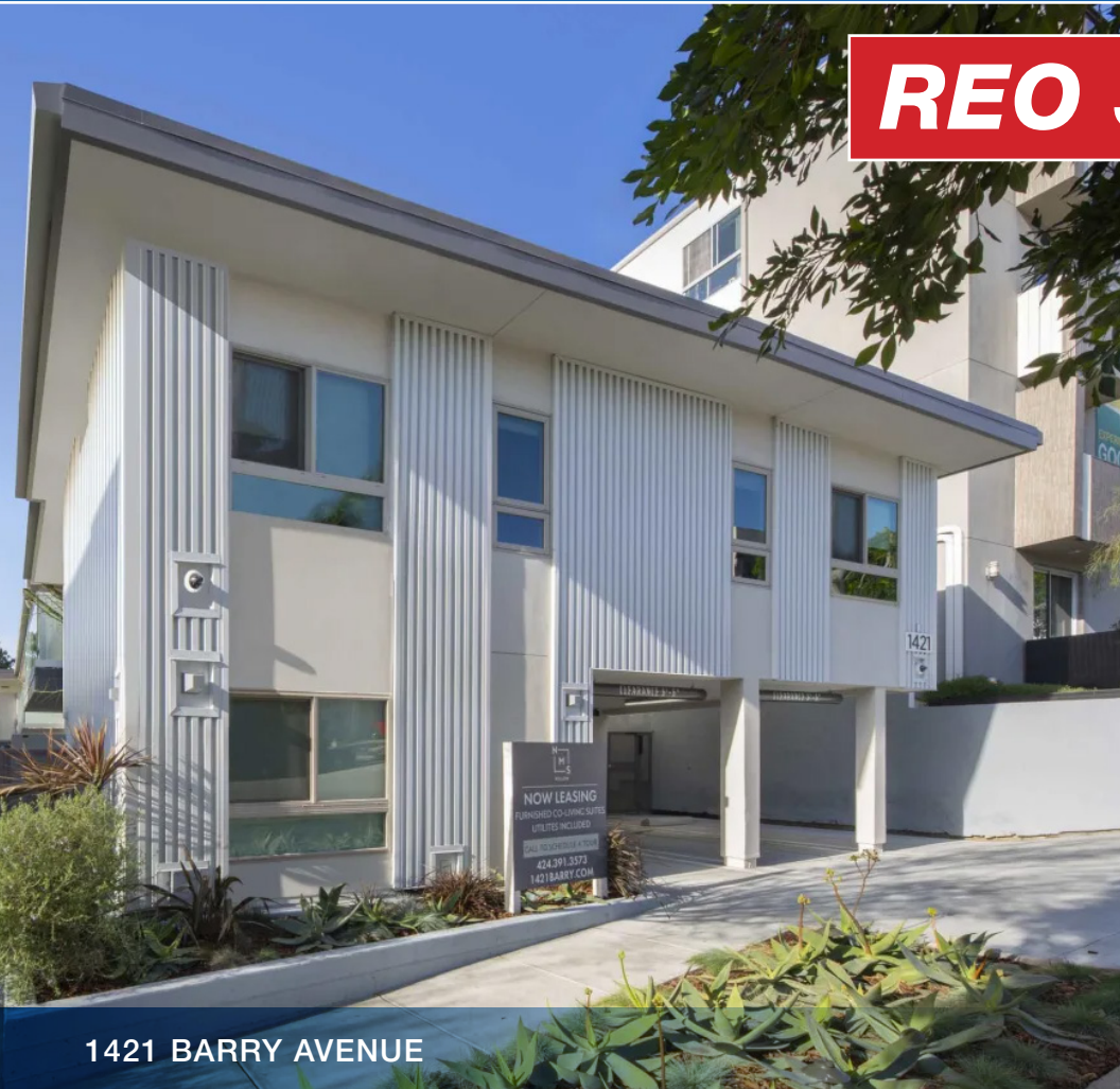
1421 BARRY AVENUE