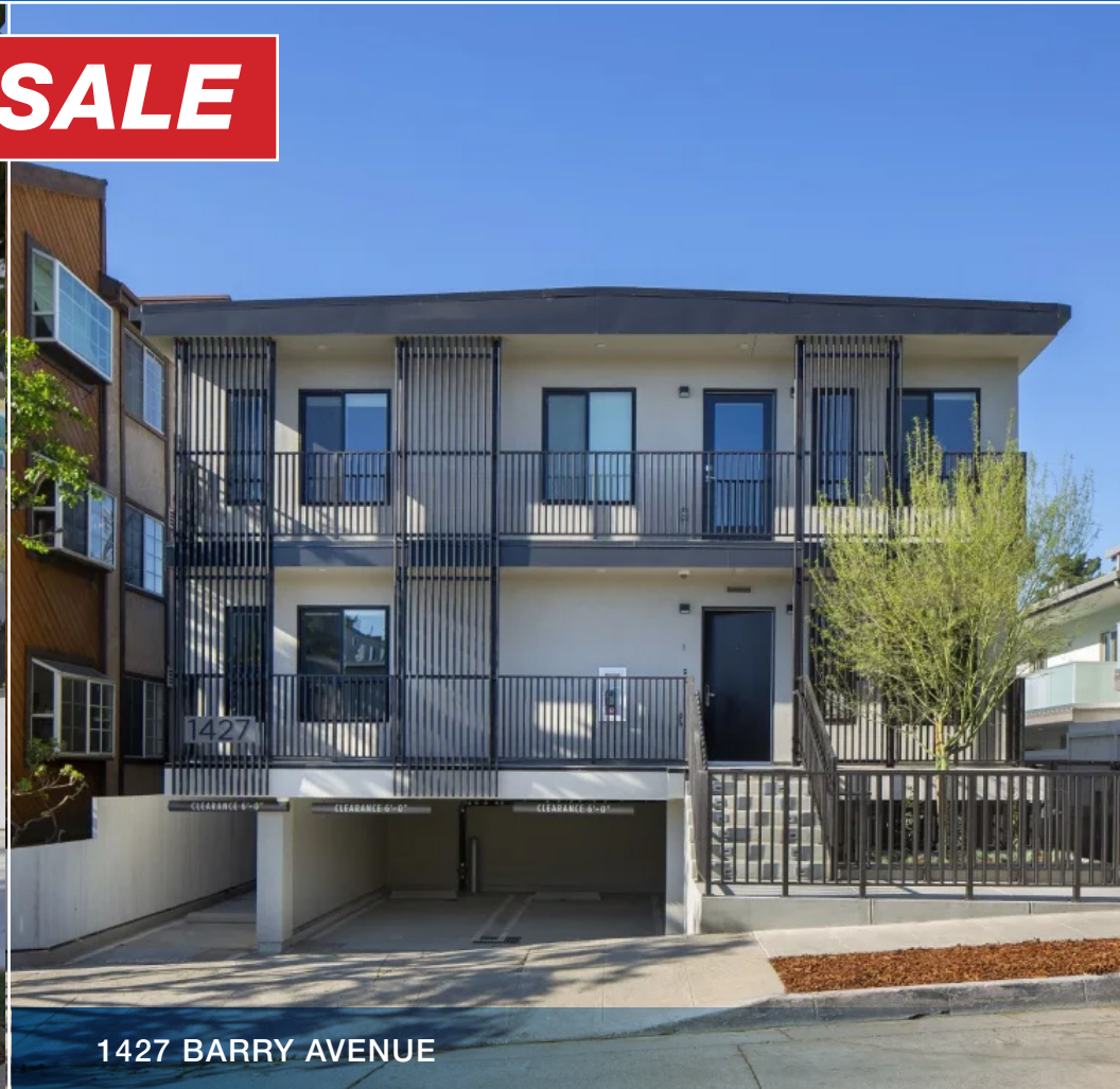
1427 BARRY AVENUE