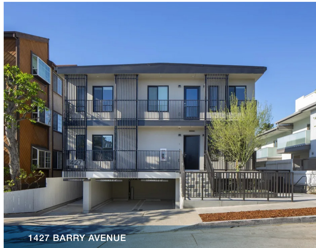
1427 BARRY AVENUE