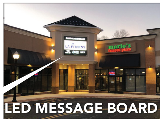
LED MESSAGE BOARD