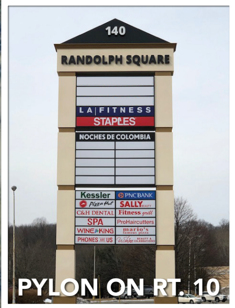
PYLON ON RT. 10