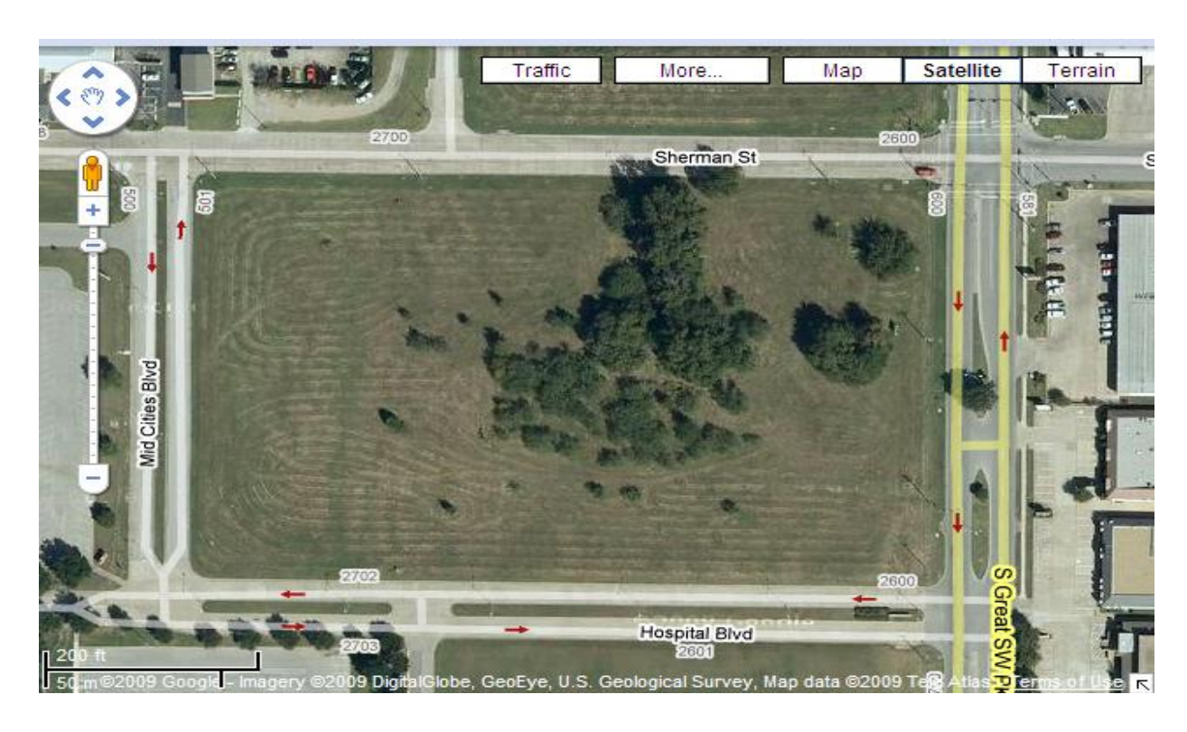
7.046 Acre Site, Corner of Sherman and Great Southwest Pkwy