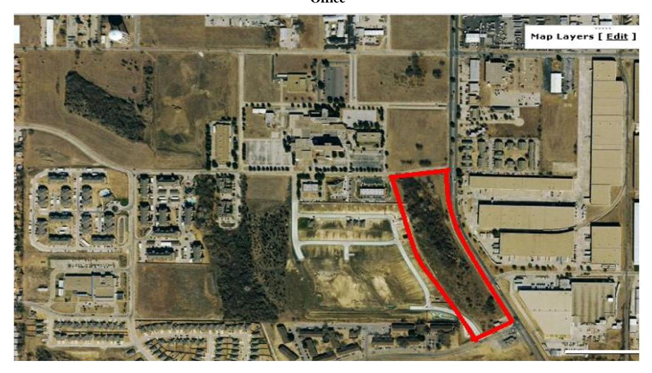
10.32 Acre Site along Great Southwest Parkway