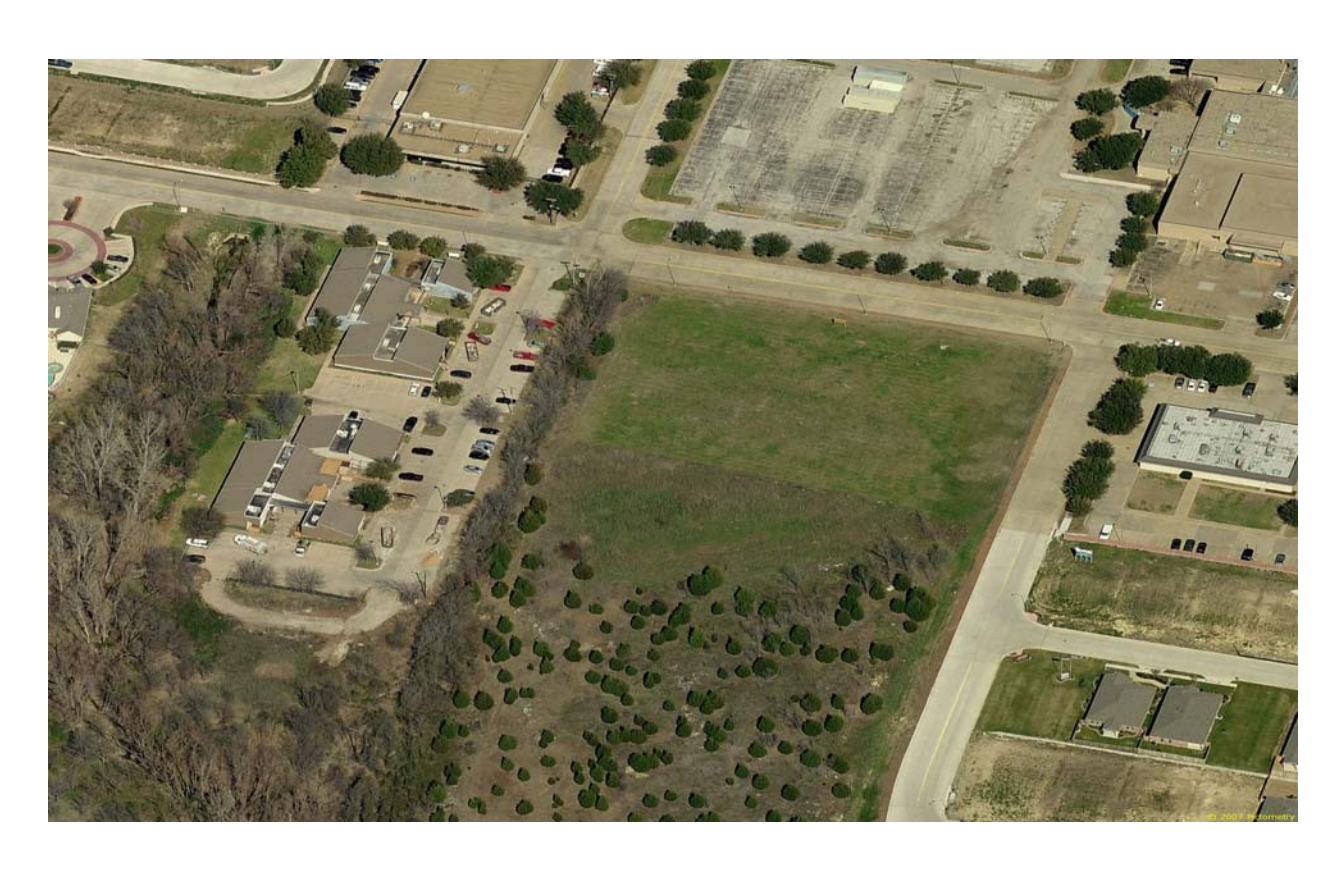
2 1.95 Acre Site Across from Hospital and Adjacent to 2801 Osler Drive 2 Medical Office