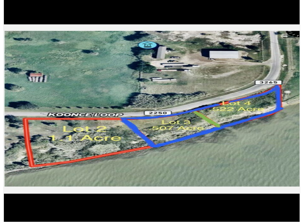
2 Lots Nueces Bay