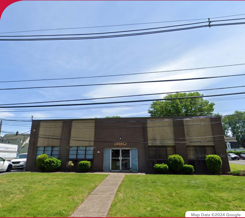
Map Data ©2024 Google

FOR SALE AS A PORTFOLIO OR INDIVIDUAL 380 & 455 LUDLOW AVENUE CRANFORD, NJ 07016