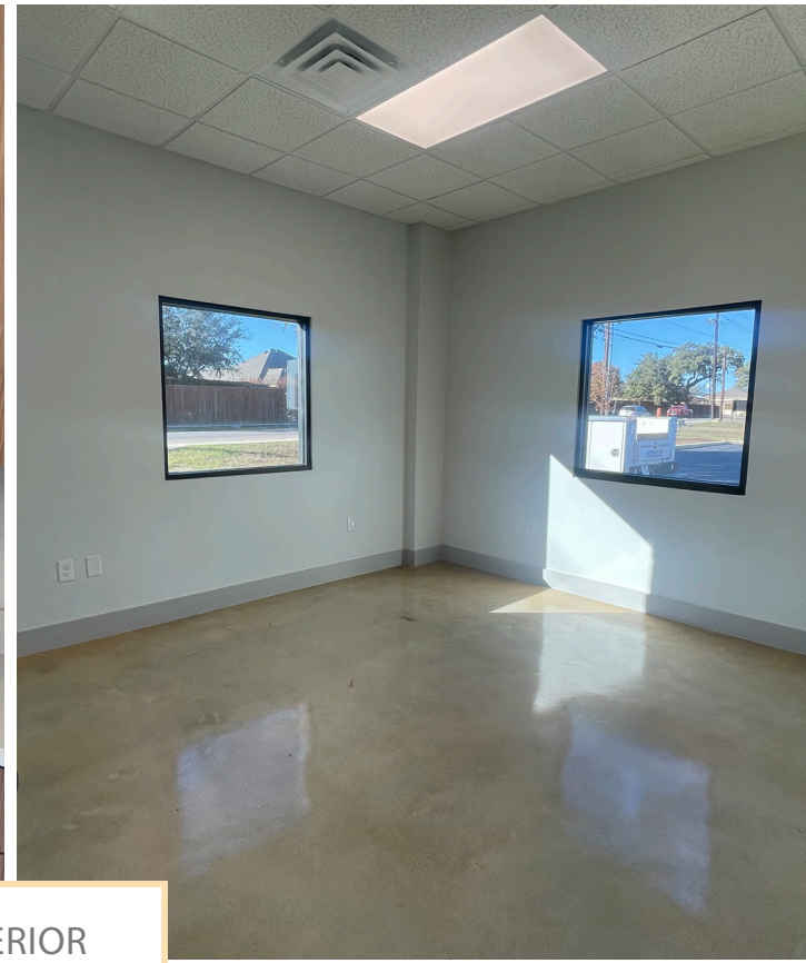
SAMPLE EXTERIOR & INTERIOR BUILDING IMAGES