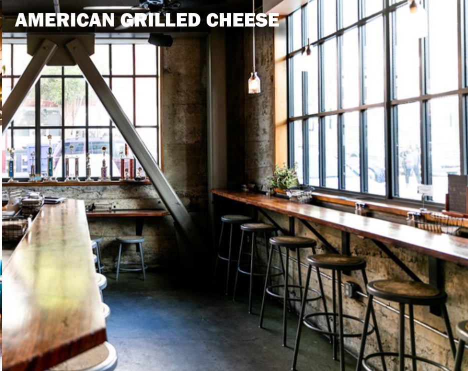
AMERICAN GRILLED CHEESE