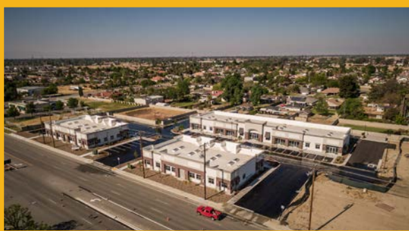
3559 Allen Road

3559 Allen Road ▪ Suite 101 ▪ Bakersfield, CA